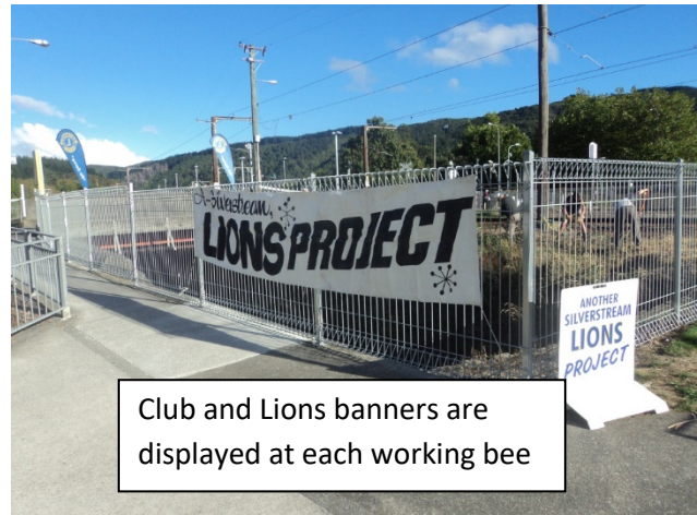
Club and Lions banners are displayed at each working bee