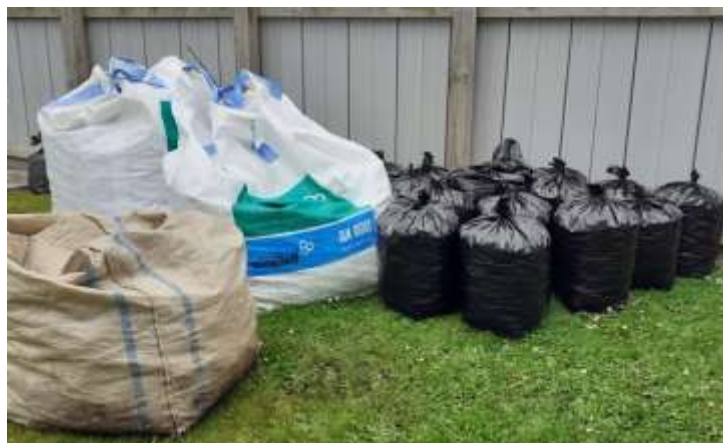
Top picture shows Terry Hemmingsen with several containers of kantabs and other recyclable metal which after sorting and bagging filled up a sizable area in his garden as shown in the lower photo.