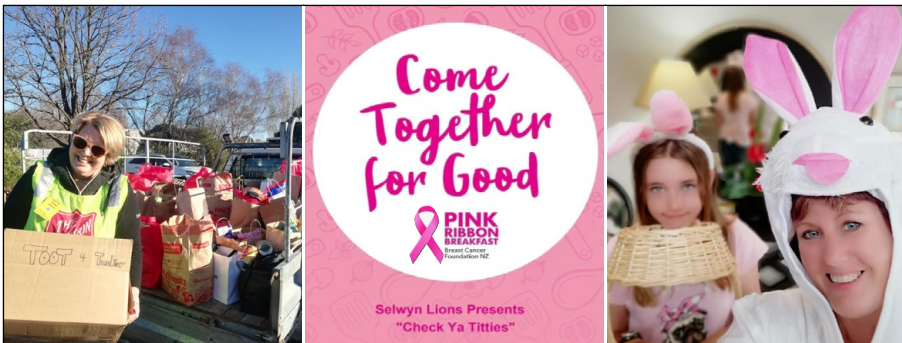
Selwyn: 1989/2002. Progressive & Dynamic. Accepting male members. Membership 20 Projects: Phone books, Toot 4 Tucker, Pink Ribbon Breakfast.