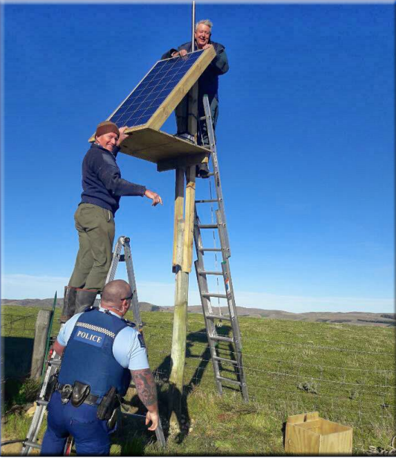
Hawarden Waikari Lions - Our club has sponsored the installation of security cameras in Hawarden and Waikari. Here we see the relay station being installed which will beam the images to the Amberley Police.