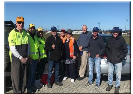
Helping Pegasus Town Club with a Lake Clean-up

Around April we have a golf tournament that unfortunately had to be cancelled this year. Our Anzac Day event is well known throughout the district and is always very well attended. At our local A & P show we support the Axemen's Association by picking up the logs and chips which are then donated or sold. At this event, we also hold a sausage sizzle where our extra-large sausages are very sought after. At Christmas, we hold an afternoon tea for Senior Citizens with delicious food, great entertainment and raffles. A Big Dig at Leithfield beach is held on the 27th December annually. This is where children dig for tokens and swap these for a prize. These successful events have been running for many years and are really well supported by the community. Our Centennial event was the construction of a bridge in the Garden of Reflection in Chamberlain Park.