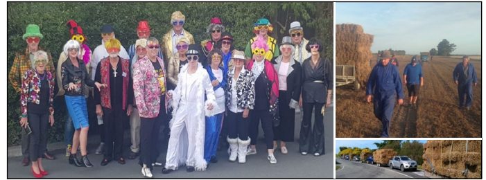
Ellesmere 1970 Our Convention Connection March 19/21 Book Early. Membership 57. Projects: Pea straw.