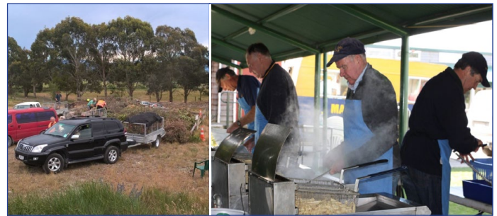
Malvern 1971: The Country Gentlemen. Membership 49. (2 new members this month!!) Projects: M/S Collection, Darfield High School Fundraiser.