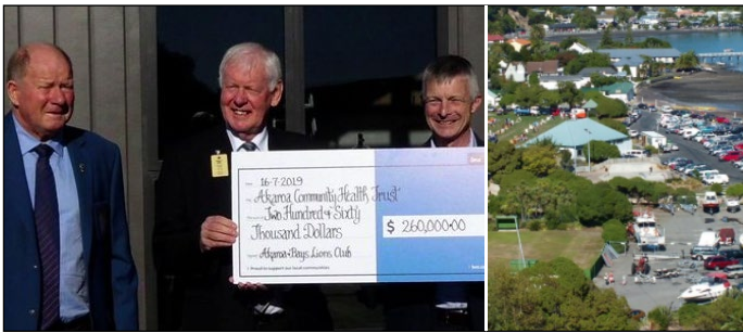
Akaroa & Bays 1972: Natures Playground. Membership 48. Projects: Mental Health evening, Paddy's Market, Golf Tournament.