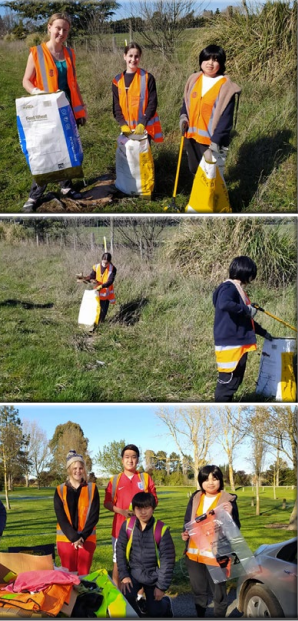
Great day for a clean up for Keep New Zealand Beautiful week.