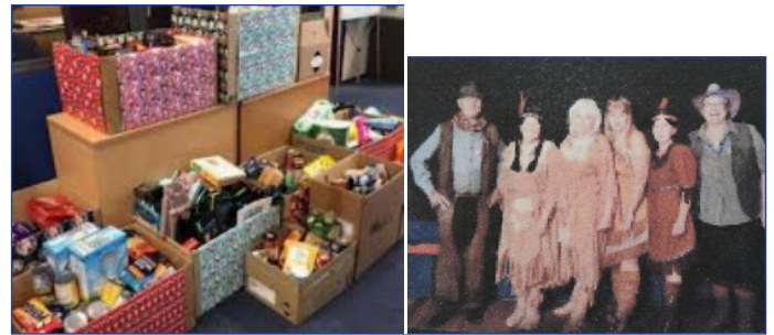
Rolleston & Districts 1978: Fast growing urban area. Membership 29 men, 13 women. Projects: Phone books, Sponsorship of Orana Park Lion. Toot 4 Tucker.