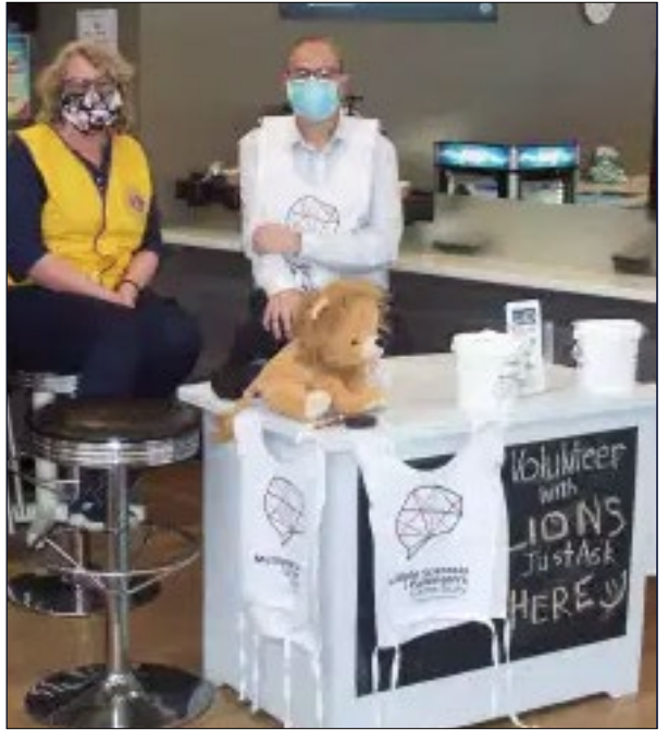
Wigram Skies Lions - collecting for MS/ Parkinsons Canterbury & promoting Lions Membership!