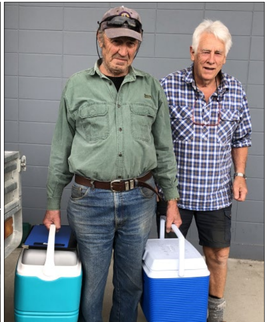
Kaikoura Lions - Meals on Wheels for the Olds by the Olds!