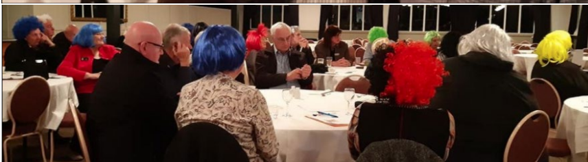
Wigram Lions - embracing Wig month for our Cancer Kids. including the hippies top.