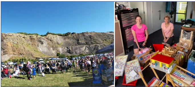
Halswell & Districts 1978: smaller Club, Great workload. Membership 13 men and 4 women. Projects: Freesia & Lilly bulbs, Pea straw, & Christmas cakes.