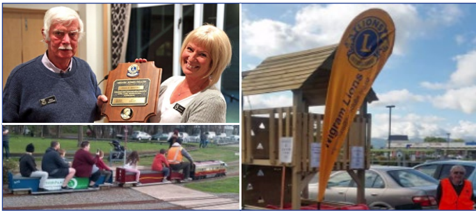
Wigram 1972: Membership 43. Projects: Phone books, Christmas cakes, a Thai dinner, Supplying dinner at Ronald McDonald house.