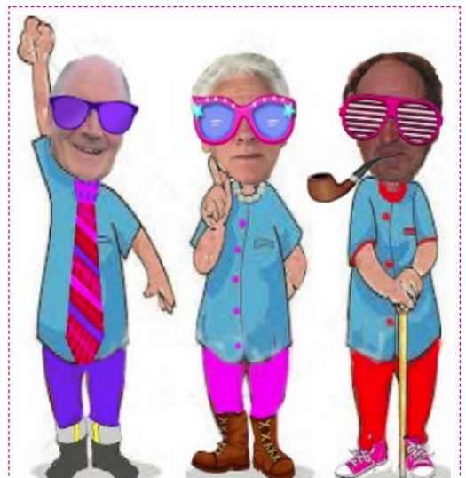
Confucius say "Membership Team who dress groovy, attract lots of new groovies."