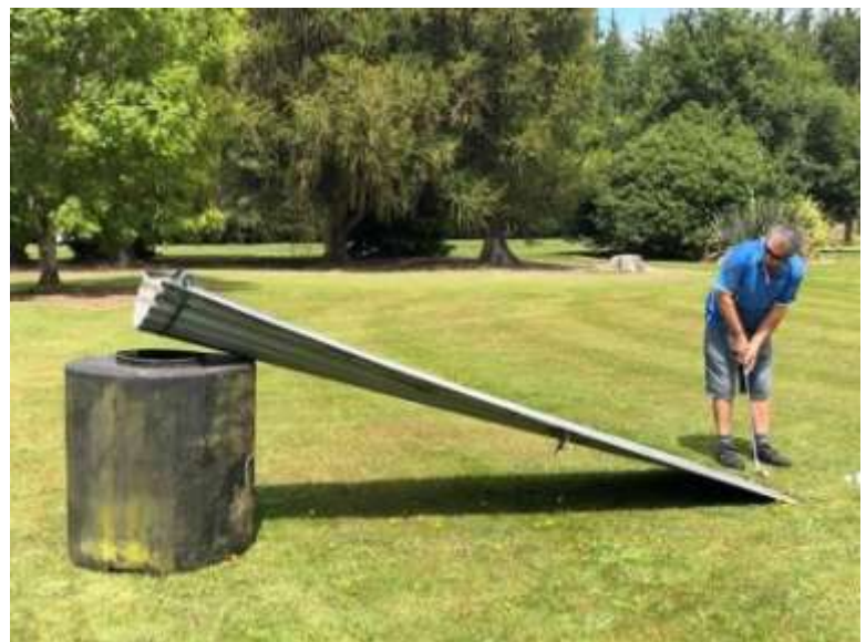
Very interesting competition In the chipping and putting.