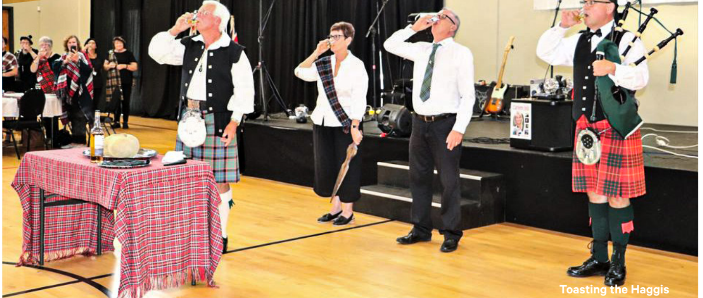
Toasting the Haggis