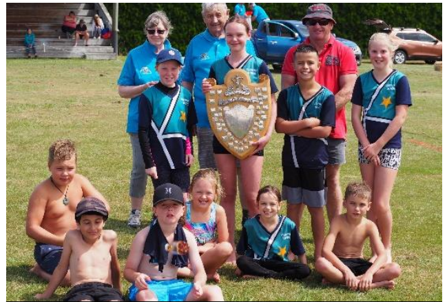
Kairanga School Winning Top School Team with sponsors.

The Rongotea Lions are especially thankful to their wives and partners for all the help they provided to Lions in the run up to the Gala as well as on the day, we couldn't run the gala without their help. Thanks Ladies . Money raised from the Gala has been donated to the new Wellington Children's Hospital Playscape project, Breast Cancer & Prostate Cancer Foundations and the Manawatu branch of the Cancer Society .