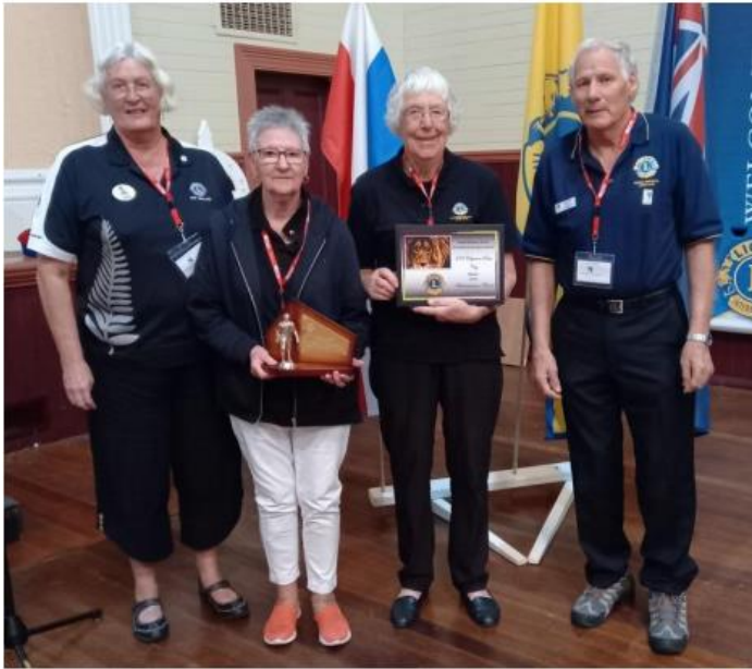
District Administration Award.

Congratulations to this year's award recipients.