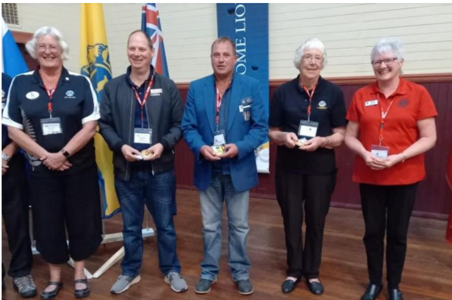
Club Excellence Awards