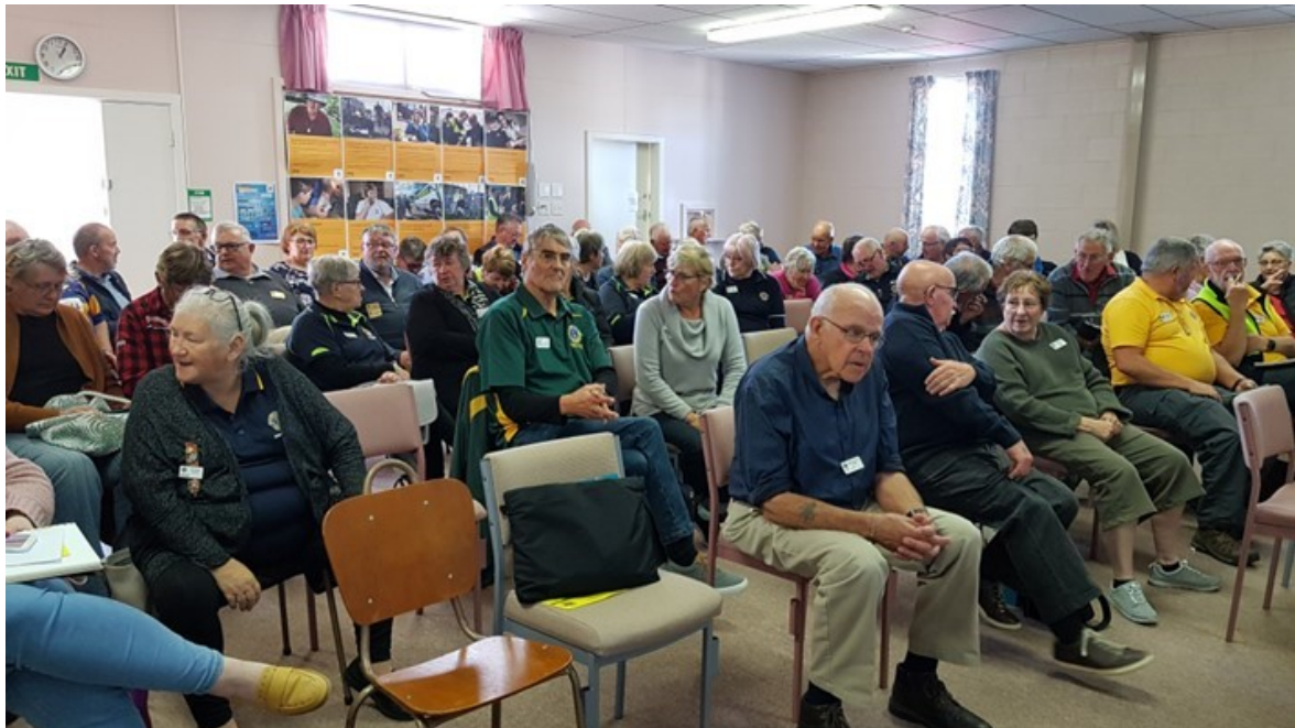
Some of the 63 Lions who attended the very informative Forum in Oamaru - a discussion opportunity.