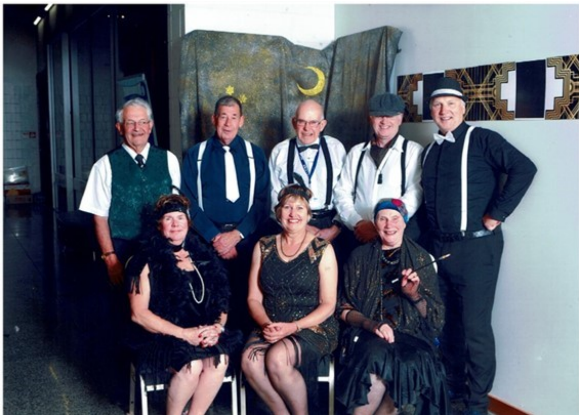
202J dressed for the Roaring 20s social Saturday 24 April