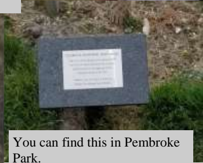
You can find this in Pembroke Park.