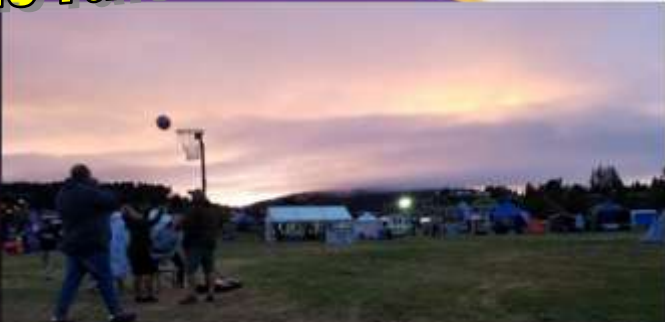
Morning sky at 6.45am