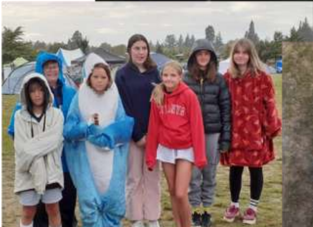
Some of the Wanaka Leos with friends. It was cold wet Saturday afternoon and night.