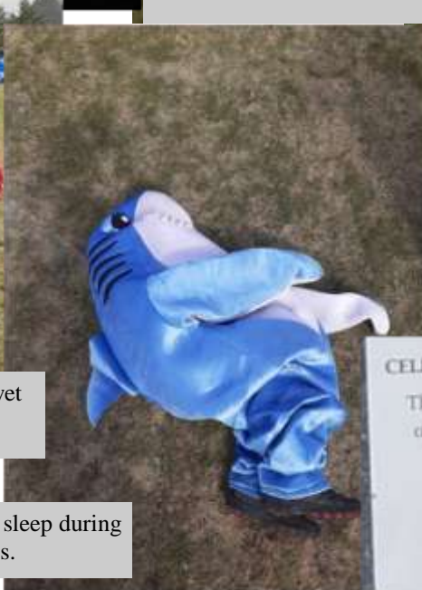
Leo shark having a sleep during the closing speeches.