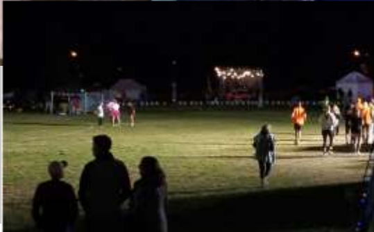
3am Sunday morning