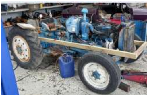
Thomas's replacement engine, transmission and mechanical components, a Ford Dexta tractor, being prepared for the 'transplant'.