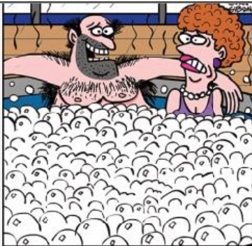
Ya know... I haven't even had to turn the jets on. These bubbles are from that awesome chili you made for dinner.

www.lionsclubs.org.nz/about/districts/taranaki-region-manawatu