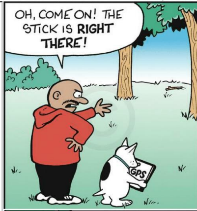
OH, COME ON! THE STICK IS RIGHT THERE!

JOKE OF THE DAY-BUMPER STICKER ON A SENIOR'S CAR "I AM SPEEDING BECAUSE I HAVE TO GET THERE BEFORE I FORGET WHERE I AM GOING"