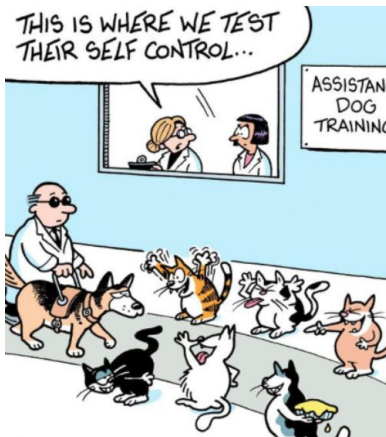
THIS IS WHERE WE TEST THEIR SELF CONTROL...

JOKE OF THE DAY-BUMPER STICKER ON A SENIOR'S CAR "I AM SPEEDING BECAUSE I HAVE TO GET THERE BEFORE I FORGET WHERE I AM GOING"