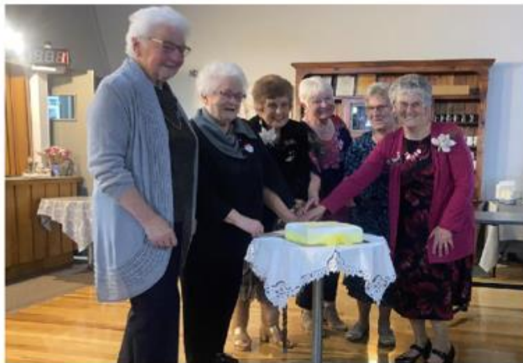
Original Charter Members