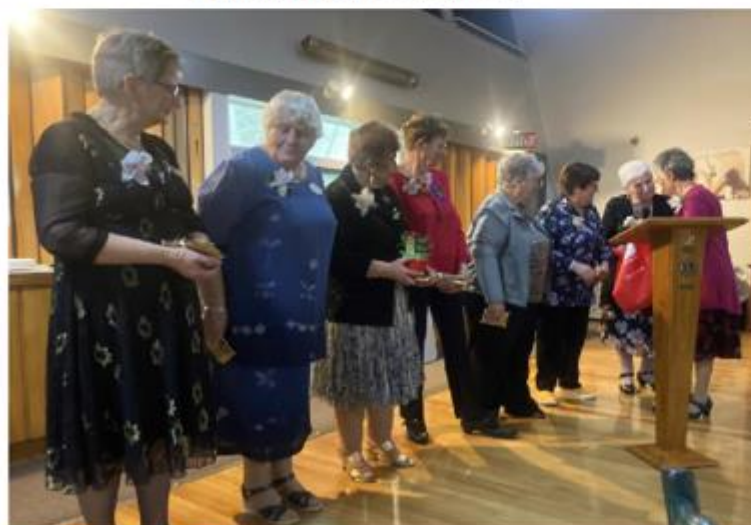
Current Members of the Feilding Kowhai Club