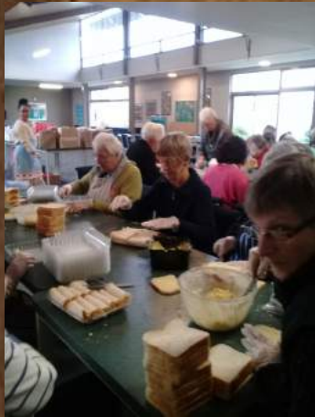
Congratulations on our cheese roll day! Many hands make light work. It was so good to be home early.