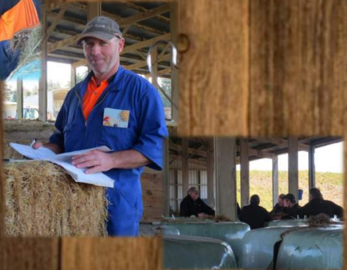
Haydrive competition which was held on 2 July