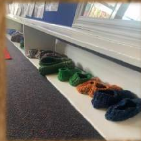
Dipton School slippers knitted by the Central Southland Lions Club.