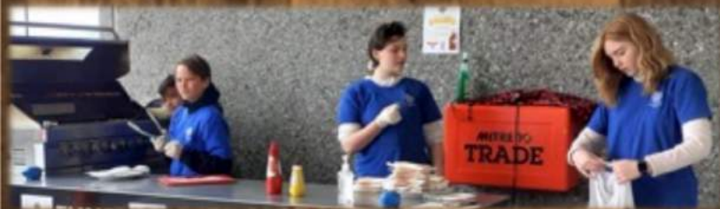
Leos BBQ Fundraising for Age Concern Central Otago branch