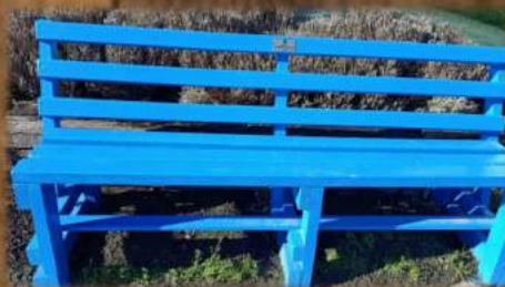
These are our newly painted seats Thanks to Liz & George for painting & now they have nice new plaques too. These are on the main street in Edendale