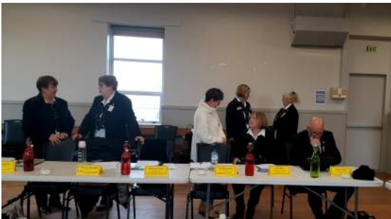
Few photos from the July Cabinet meeting held in Cromwell.