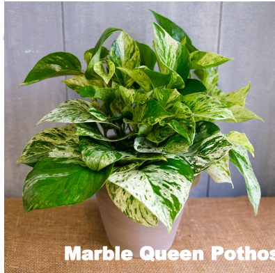
Marble Queen Pothos