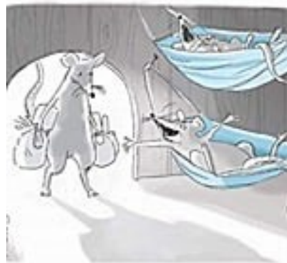
"FREE HANMOCKS, all over town. It's like a miracle!"