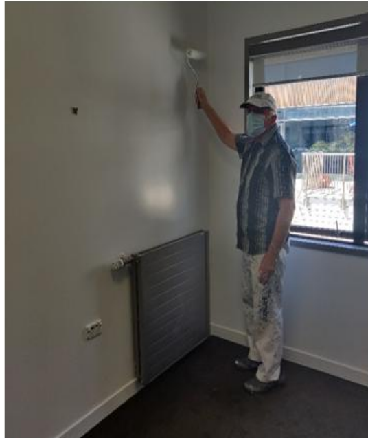
Making a start on the painting of each room 😊

Remember if your Club would like to be part of this amazing 10 th Birthday refit and have your clubs name put on a bedroom door, below is the bank details to make your donation.