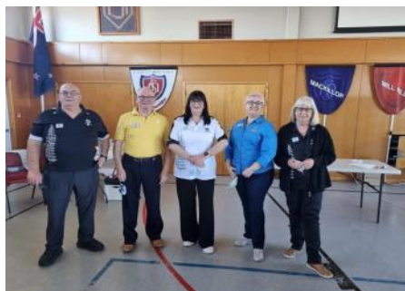
The Vital Team

As this is the last note from Ken for this year, it would be remiss of us not to thank everyone who has had a part to play in this new initiative. So, as Ken says all work and no play makes Ken a dull parrot! Ken wants us all to have a good break after a difficult year which has seen a pile of challenges to us all. Ken intends to fly back down to his old stomping grounds and take a break while tearing a few window wipers off cars, adding to his shiny spoon collection while he charges his battery for 2022. If you would like more information or a visit from our team – don't be shy, give one of them a call – they will be pleased to help!