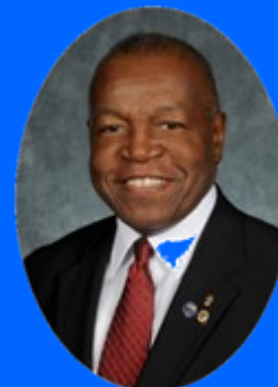
Service from the Heart

J-Times can be viewed online at the MD 202 website at https://www.lionsclubs.org.nz/about/districts/central-south-island-east-coast/202j-district-news-bulletin