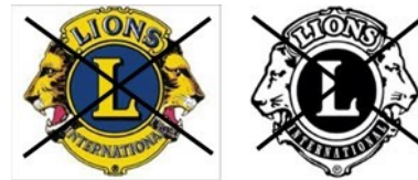
Obsolete Lions logos

If you just Google "Lions logo" or similar wording without going to LCI's website you'll find all sorts of incorrect unofficial or obsolete versions (see below) - please don't use these.