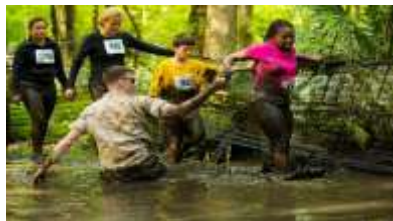
This Photo by Unknown Author is