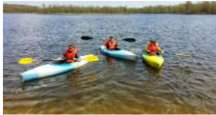
This Photo by Unknown Author is li-