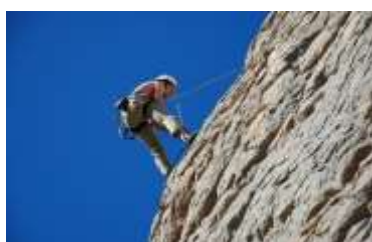
This Photo by Unknown Author is