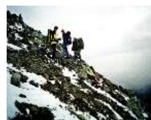
This Photo by Unknown