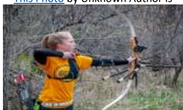
This Photo by Unknown Author is