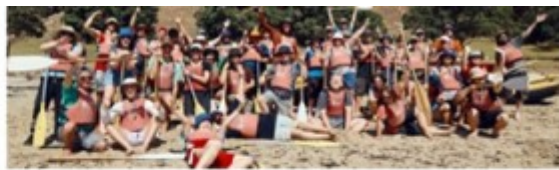
Inspiration Voyage - February 2022