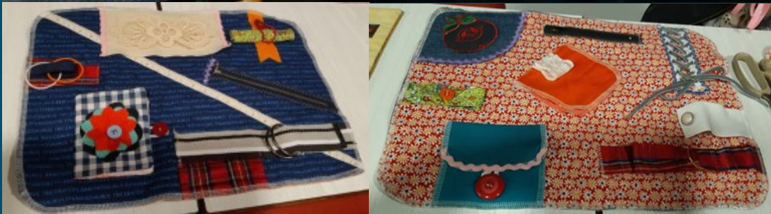
Temuka District Lions making fidget blankets for the community