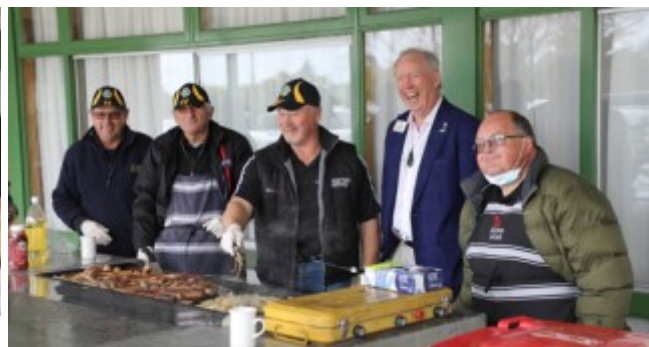
A lunchtime BBQ provided by Temuka Lions Club at Caroline Bay Saturday 9 July for the children in the community who braved the cold, wet day to ride the Bike Skills Park.