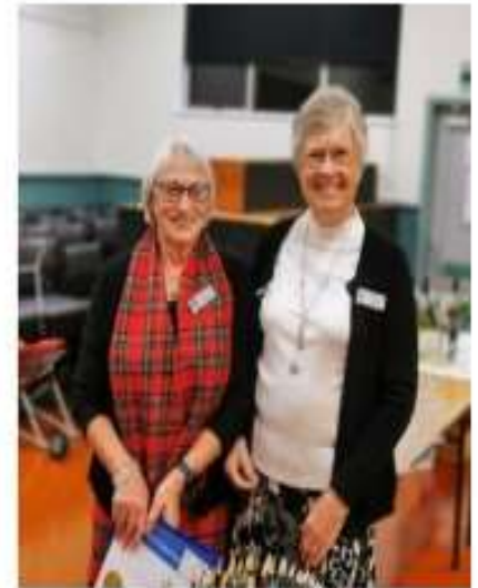
2022 OMOKOROA LIONS CHANGEVER DINNER