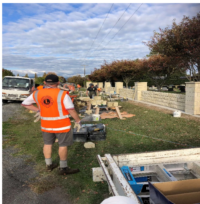
Above: All hands on deck for the final push to complete the block construction.