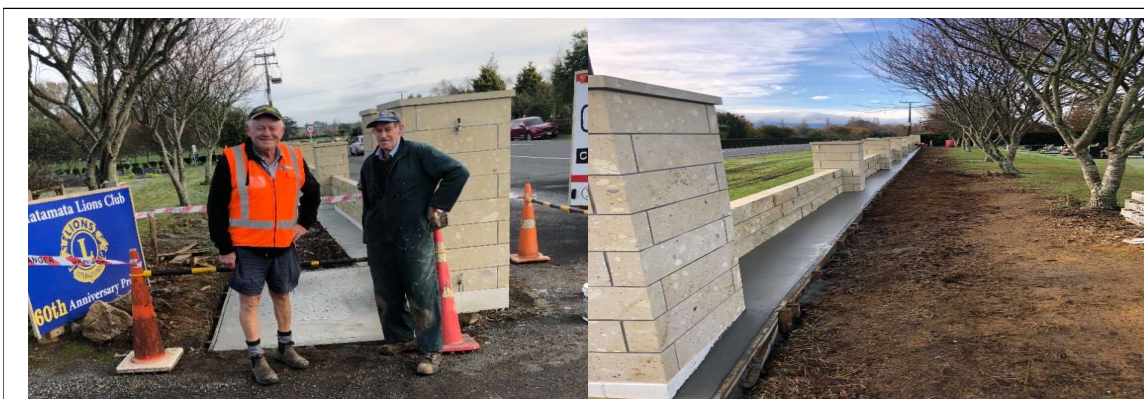
Below: Mowing strips are now complete, awaiting black rails and gates.