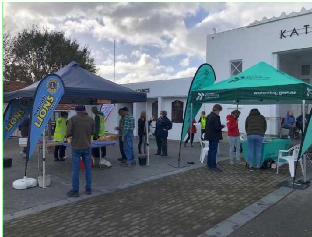
The Katikati Team out and about with Western Bay Council running a sausage sizzle. Visibility, Presence and Awareness 101 !