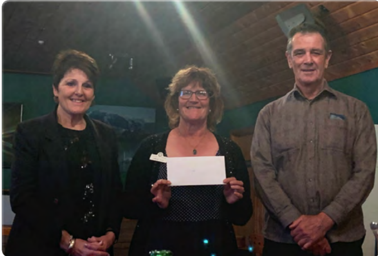
Kaikoura Seaward Lions - presented $14,500 raised from our Trash to Fashion show to St John's Kaikoura, for the new ambulance station. This will buy fridges, ovens, washing machines, microwaves and two pavers.