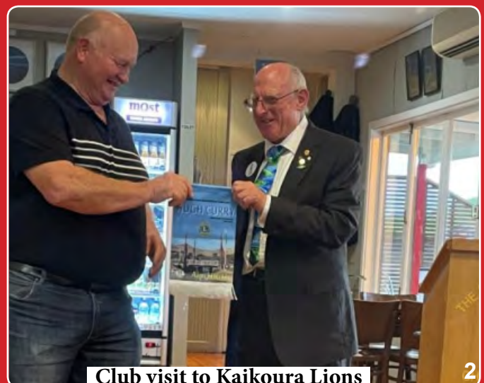
Club visit to Kaikoura Lions