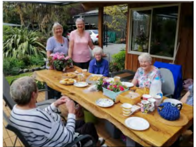
Beavertown Blenheim Lions - A group of seven had a lovely day last week where we assembled 50 little posies for The Elderly.