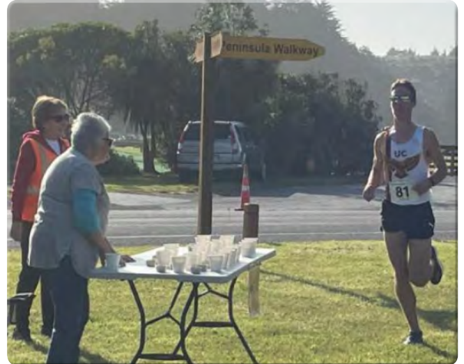
Kaikoura Lions and the Kaikoura High School have joined together to run an annual Marathon. This has proved to be a very successful project with more contestants each year. A great way to support our youth and Lions with much needed funds.