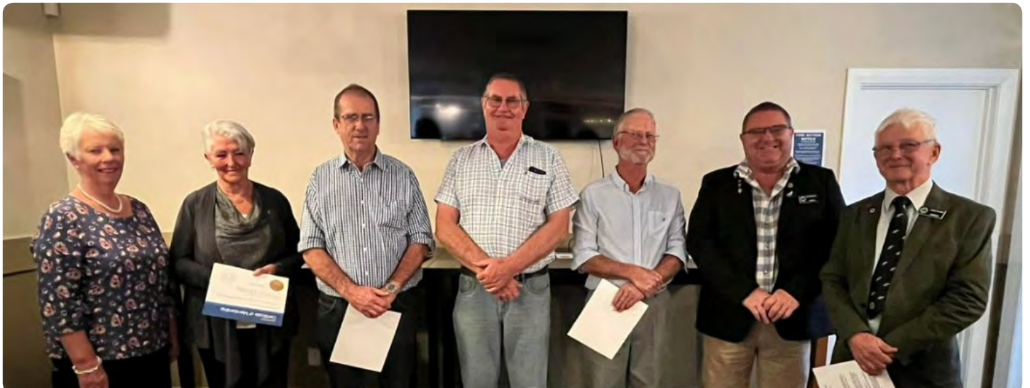
Amberley Lions welcomed three new members into their Club at their November supper meeting.