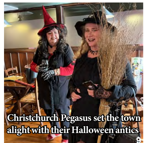
Christchurch Pegasus set the town alight with their Halloween antics