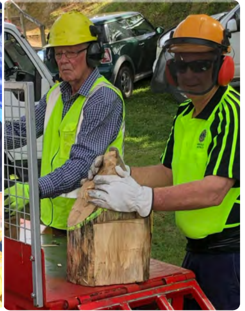
Fantastic day at the Amberley A&P show! What a stunning day! Amberley lions were doing our thing at the wood chop, where we had garden fertiliser for sale and the obligatory sausage sizzle. We also MC'd the 'paddock to plate'.