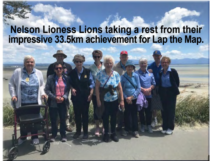
Nelson Lioness Lions taking a rest from their impressive 33.5km achievement for Lap the Map.