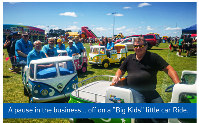
A pause in the business... off on a "Big Kids" little car Ride.