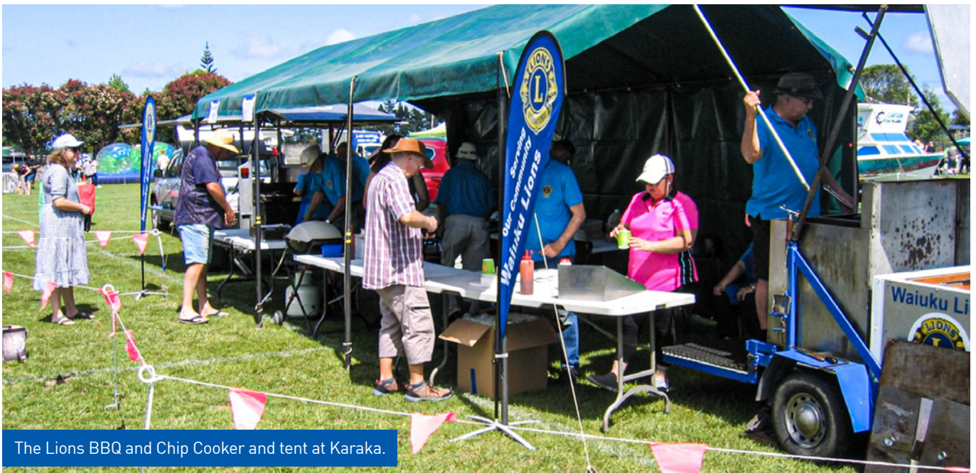
The Lions BBQ and Chip Cooker and tent at Karaka.