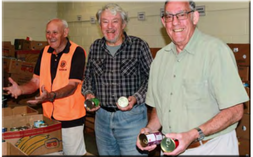
Blenheim Lions - With willing teams of helpers working over 3 and a half days, the disorganised heap was turned into organised piles. All items are packed in boxes of similar product to be dated and then packed away. 19 members, 106 hours. A great team effort!