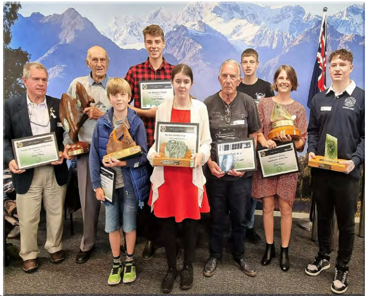
Hokitika Lions - Congratulations to the recipients of the Hokitika Lions Club Community Awards. (Hokitika Lions posts certainly put their name out on the w.w.web - take a look at their Facebook posts.)