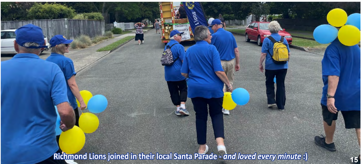
Richmond Lions joined in their local Santa Parade - and loved every minute :)