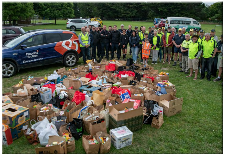
Amberley, Glenmark, Rangiora, Woodend-Pegasus and Oxford Lions - all combined to fill their foodbanks to overflowing. Firemen, students and of course Lions members and families were all on the end of sirens, horns and collecting full bags. 9