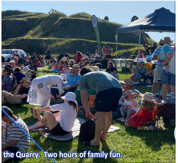
Halswell Lions - Christmas Carols in the Quarry. Two hours of family fun.