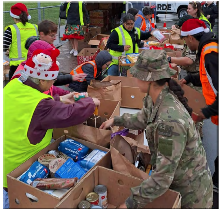
Selwyn Lions - Toot for Tucker - Rolleston 2022 absolutely rocked, thanks so much to everyone who donated! The total was around 99 banana boxes of non-perishable foods, all destined for local foodbanks. Thanks also to all the volunteers, it literally wouldn't have happened without you.