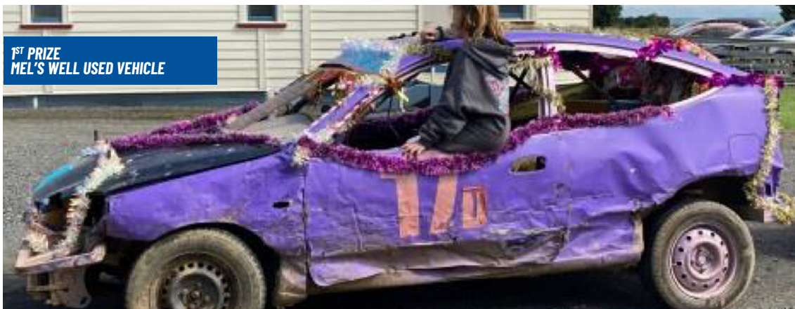
1 ST PRIZE MEL'S WELL USED VEHICLE