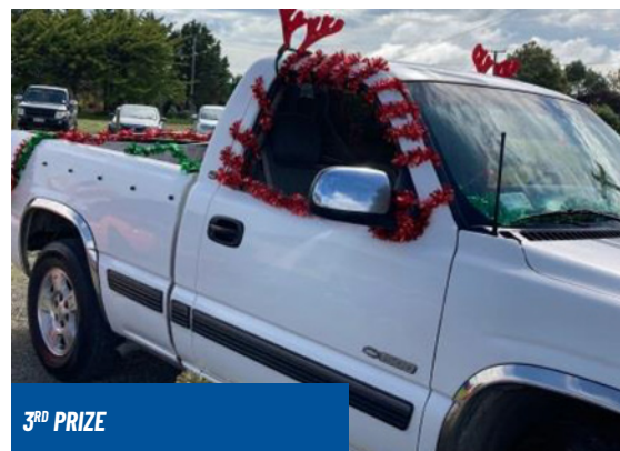
3 RD PRIZE