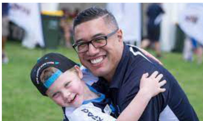
Baking making Happy Faces since 2013.

Everybody at camp is ecstatic at the efforts and extremely grateful for all the baking that comes through.