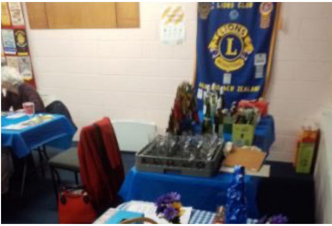
Lion Ton (rear) led with Invitation to all to sing the National Anthem and then proposed the Loyal Toast.