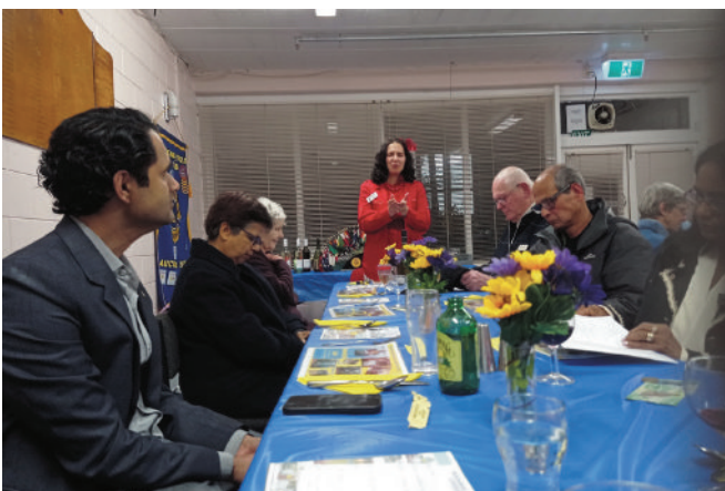
After the dinner and dessert was enjoyed, everyone was in fine fettle with conversation humming along, members and guests strategically seated to mix and mingle in the fellowship Lions are The 45th Anniversary cake was brought out and "tabled".