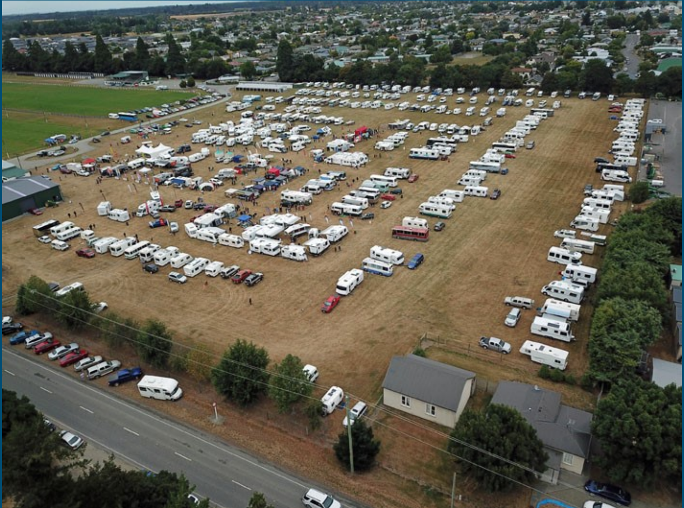
The South Island Motorhome Show, Ashburton during a previous year