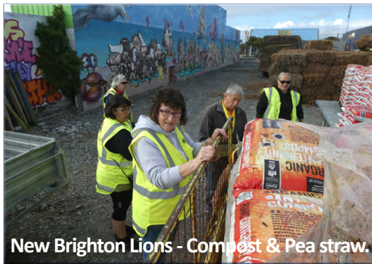
New Brighton Lions - Compost & Pea straw.