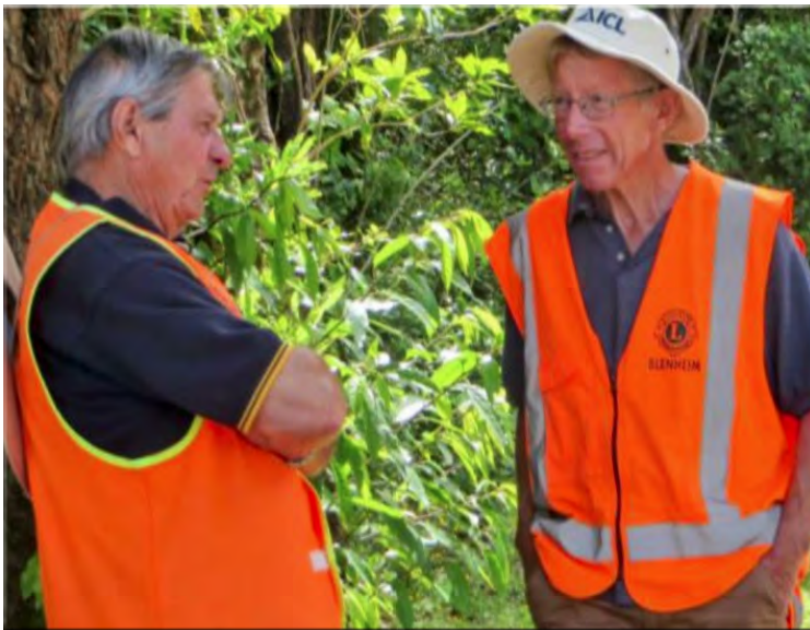
Blenheim Lions 'working' parking cars at the Whites Bay Beach Dig.