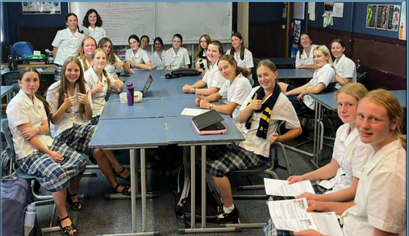
Marlborough Girls College Leo Club 2023 with 33 members. (12 members absent)