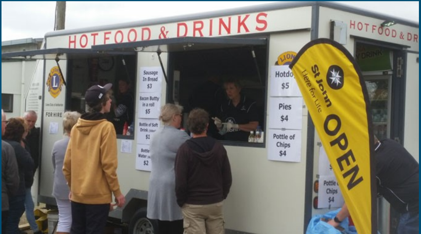
Ashburton Lions Food Trailer being operated at the South Island Motorhome Show by St John Cadet Unit.