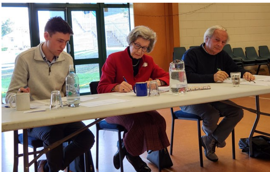
The judges hard at work deliberating