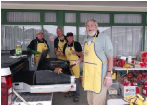
Left: Enjoying a BBQ project

If you are interested in being involved in our club and your community, go to Facebook – timarusuburbanlions or contact projects@timarusuburbanlions.org.nz