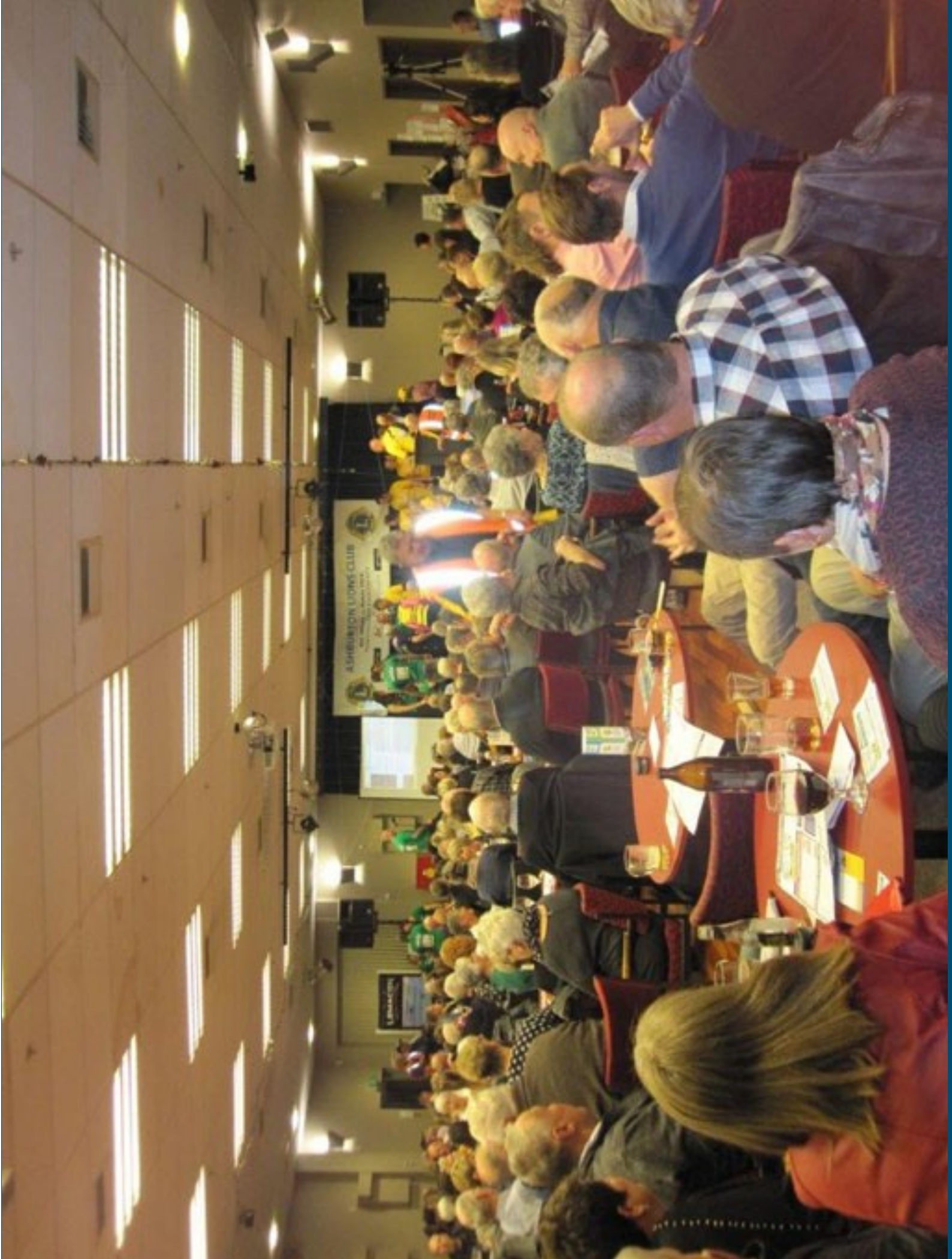
Ashburton Lions Fundraiser Big Smoke versus Rural Folk fun competition and auction.