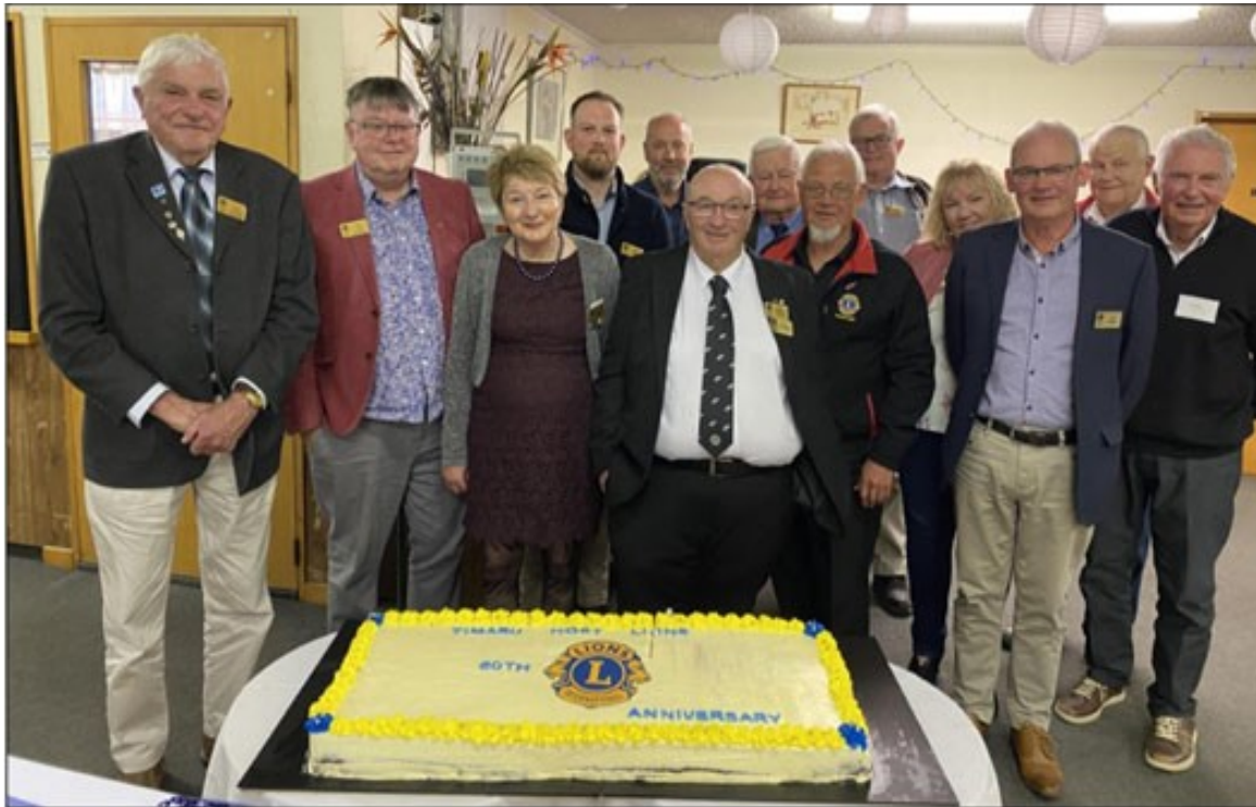
The 2023 Lions Club of Timaru Host Board and the 60 th Anniversary Cake