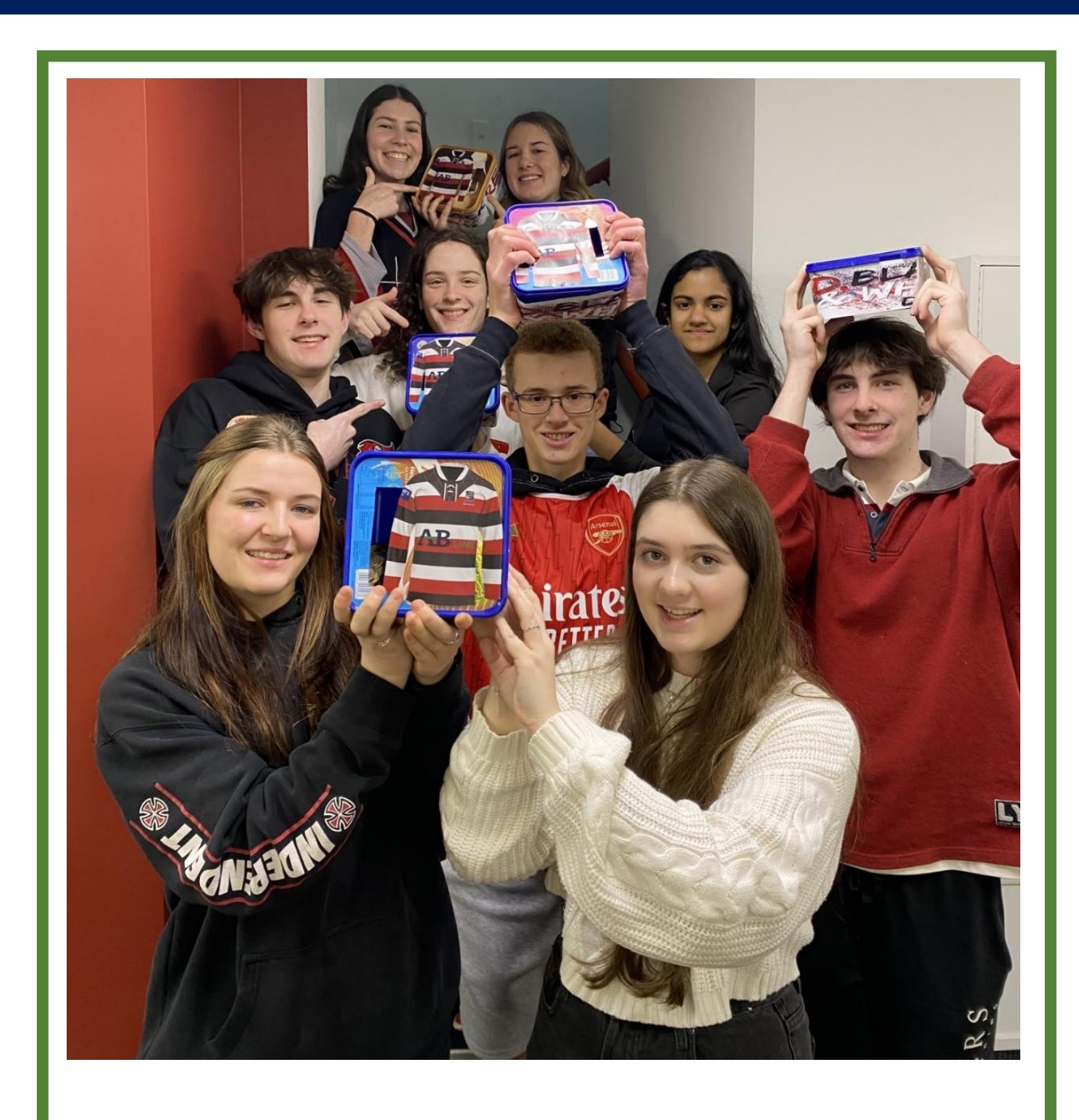
JHC Leo Club

Leo leaders collecting for Red, Black and White Day