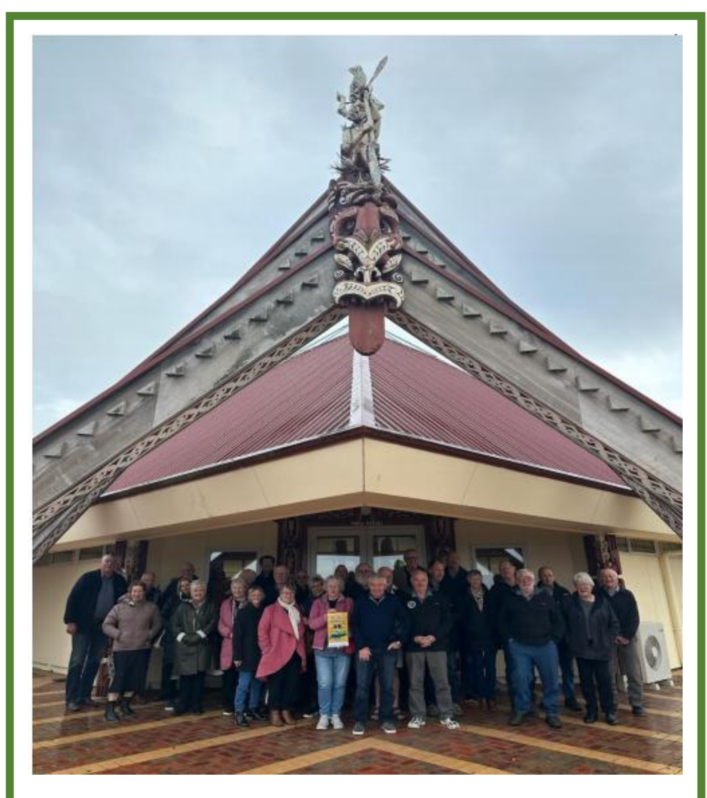
Bluff Marae Visit