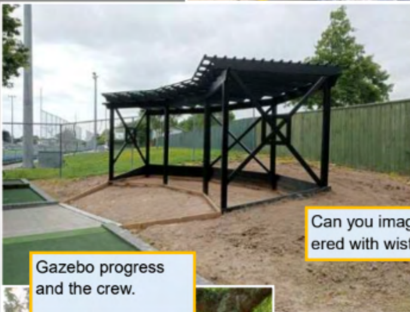
Gazebo progress and the crew.

Can you imagine this covered with wisteria?