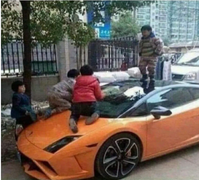
A Chinese businessman has shared this image saying that happiness of children is the most valuable thing in the world. A million dollar worth Lamborghini is nothing nothing in front of that. So he allows the kids to jump and play on this Lamborghini. The best part is that the kids are not his and neither is the Lamborghini.

Why you shouldn't wait until retirement to start traveling