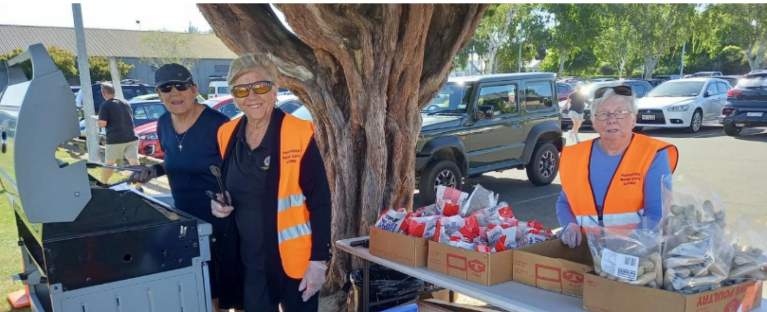
PN Papaiouea Rose City Lions