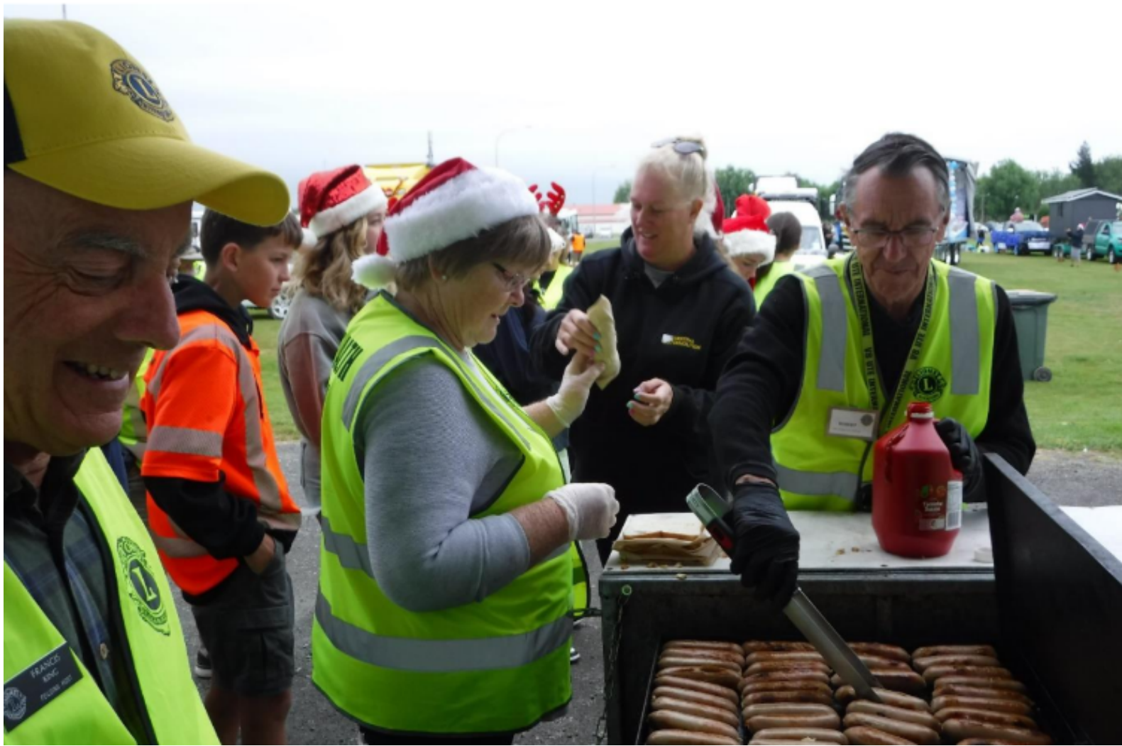
Feilding Host Lions Club