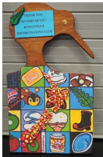
A Kiwiana trophy presented to our club in recognition of our help and support.