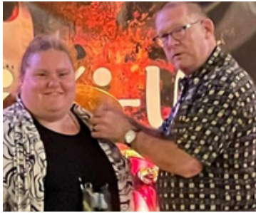
Inducting new members