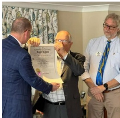
Presenting charter to our newest club - Clearview Park