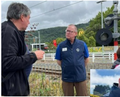
Seeing and learning about projects first hand