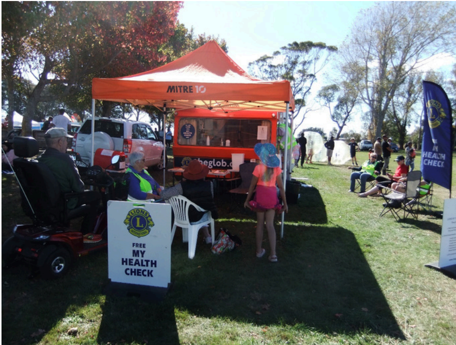
Photo at Marton Festival site visit.

The 202D District Waverly Award for Community Service was presented to the My Health Glob Project Team participants