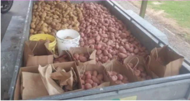
Relaxation and finally time to chat after the big dig.