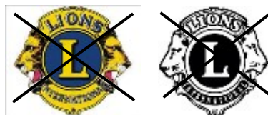
Obsolete Lions logos

What appeal would old-fashioned branding have for the younger members we are trying to attract?