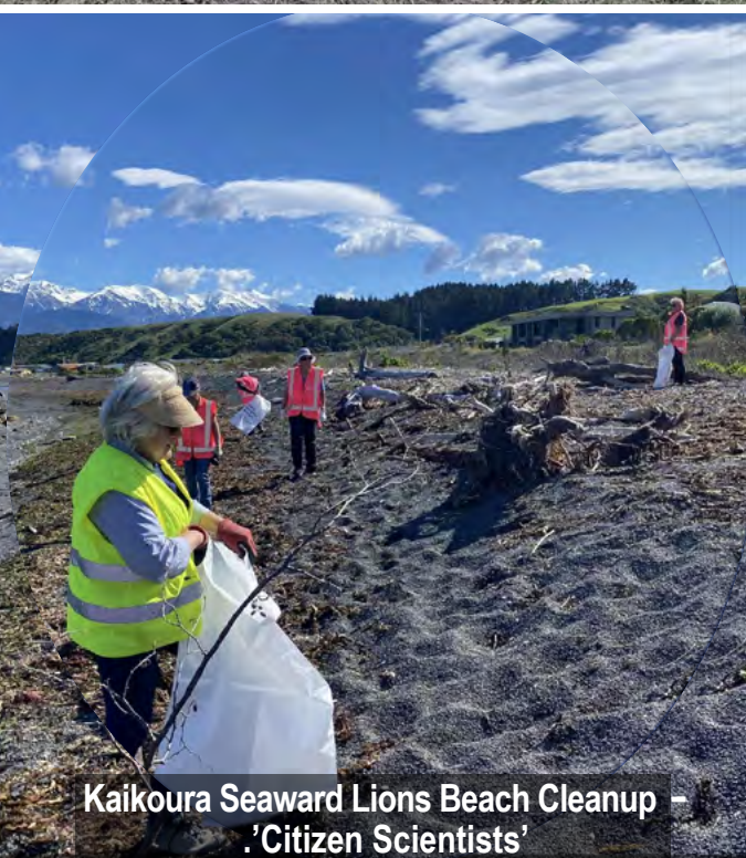
Kaikoura Seaward Lions Beach Cleanup - 'Citizen Scientists'