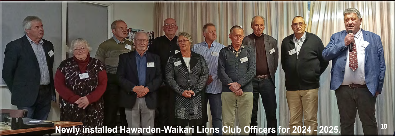
Newly installed Hawarden-Waikari Lions Club Officers for 2024 - 2025.