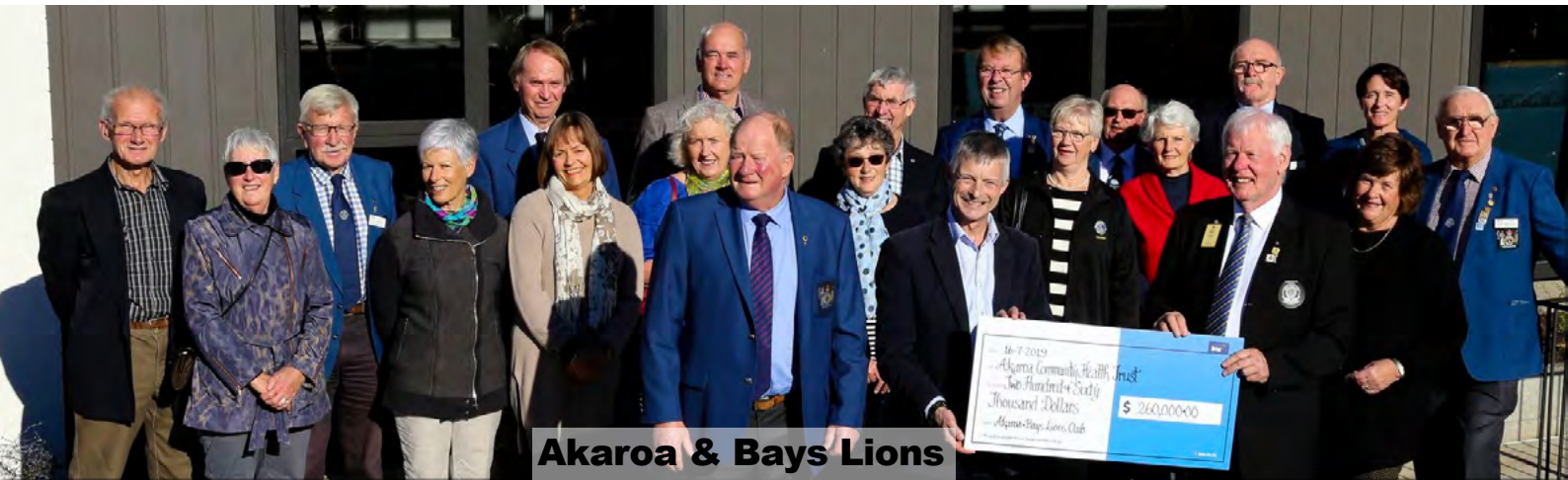
Akaroa & Bays Lions