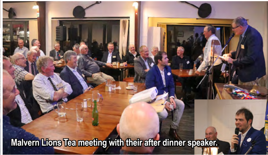
Malvern Lions Tea meeting with their after dinner speaker.