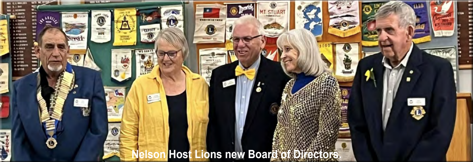
Nelson Host Lions new Board of Directors.