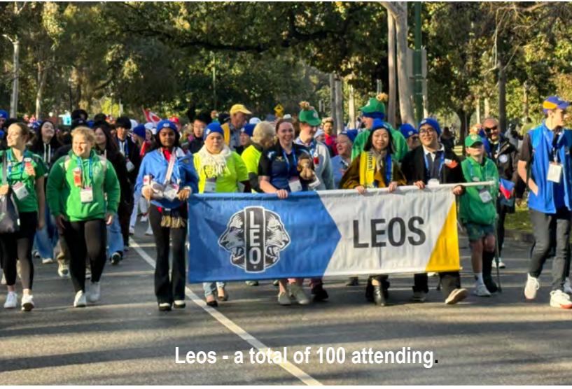
Leos - a total of 100 attending.