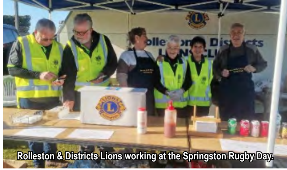
Rolleston & Districts Lions working at the Springston Rugby Day.