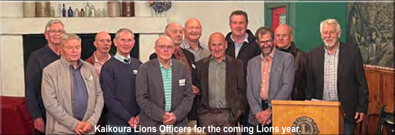
Kaikoura Lions Officers for the coming Lions year.