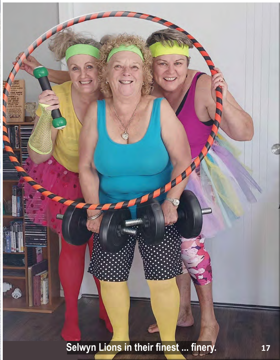
Selwyn Lions in their finest ... finery.