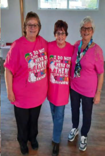
Nelson Lioness Lions Pink Ribbon - bingo game, quick quizzes, a scrumptious afternoon tea and the joyful paper bag auction.