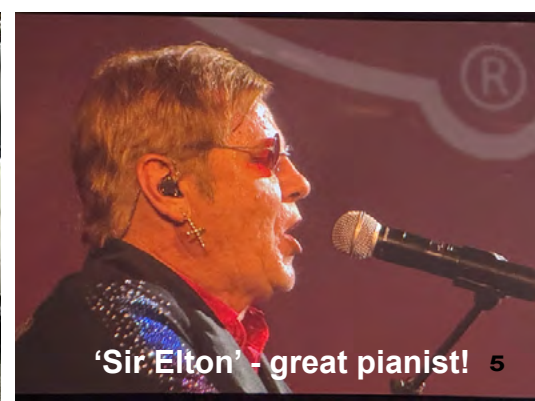
'Sir Elton' - great pianist! 5