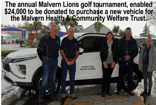
The annual Malvern Lions golf tournament, enabled $24,000 to be donated to purchase a new vehicle for the Malvern Health & Community Welfare Trust.