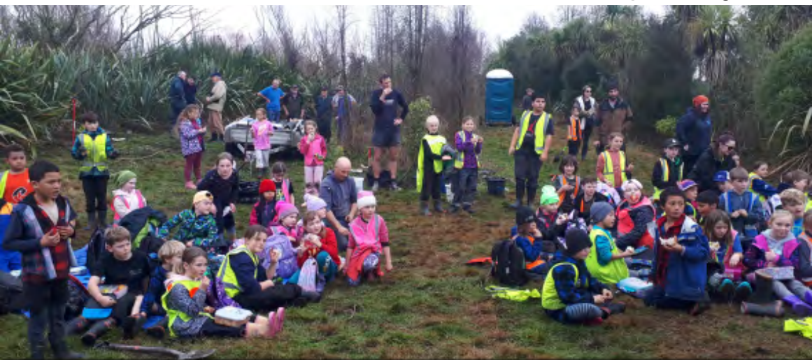
Ellesmere Lions - left - children and teachers Tree Planting at Rakaia Island, Approx. 800 plants were planted, a good turnout of helpers, about 8-10 Lions, well done to everyone involved.

through it to recycle where possible. Over ten large bags were filled and are now being disposed of responsibly.