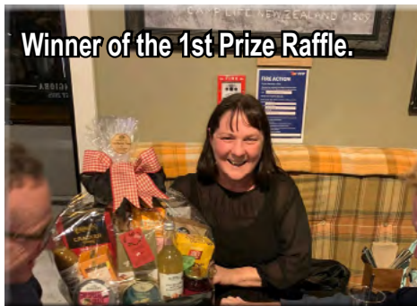
Winner of the 1st Prize Raffle.