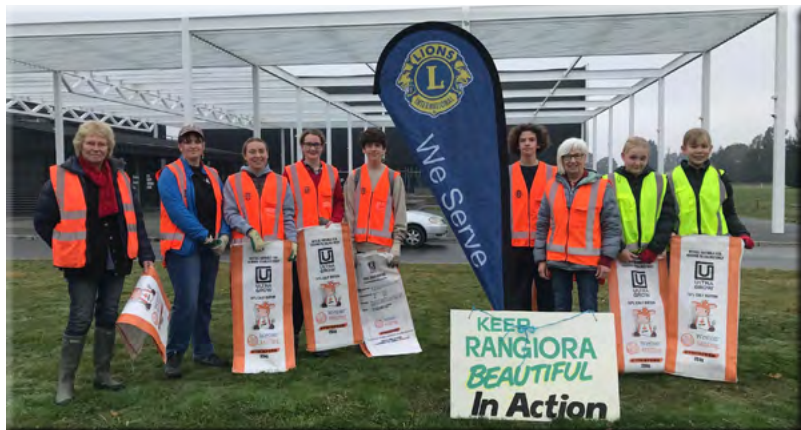
RHS Leos - above - Five Leo's and five helpers spent our morning cleaning and tidying up our local Rangiora roadsides, car parking lots, footpaths and garden areas by collecting rubbish, sorting

through it to recycle where possible. Over ten large bags were filled and are now being disposed of responsibly.