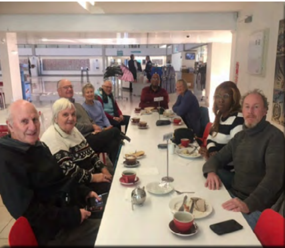
Christchurch Host Lions - Coffee Meet Bliss. The team came out to enjoy some good conversation, good coffee and even better company!