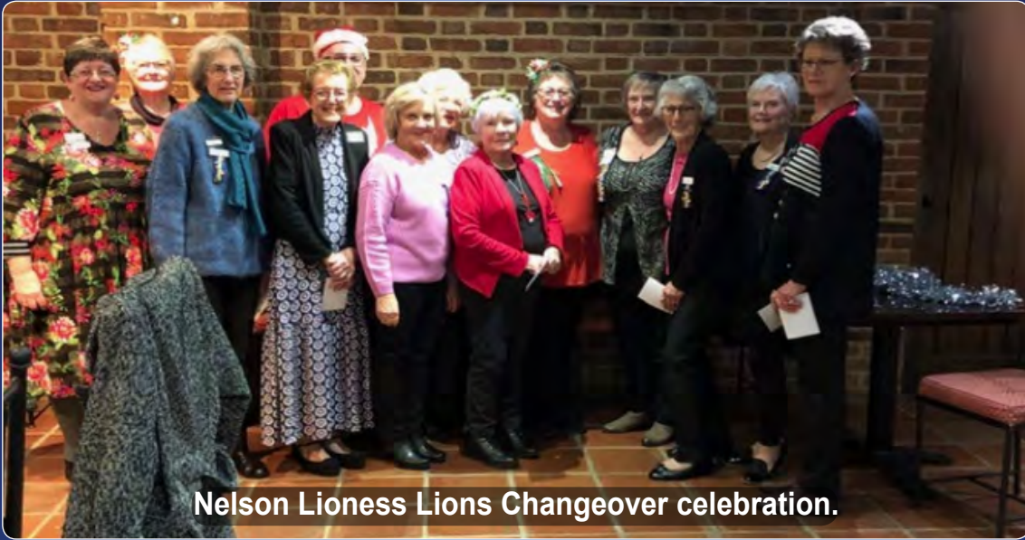
Nelson Lioness Lions Changeover celebration.

As we begin our new Lions year let's all be mindful to meet the new challenges this year will bring. Let's be positive about new ideas, new ways of doing activities and projects. Look outside the square for solutions when the path gets too steep - (Nelson Lioness Lions bulletin - Jan.)