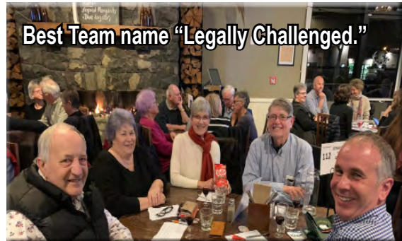
Best Team name "Legally Challenged."

All that I just mentioned came very apparent when organising the fundraising Leo Quiz night. A great fun night with everyone behind the 'good cause'. They raised $1818.00 and the Leos donated $2000 to the Hope Community Trust, next door to the school: $1000 for bins for their foodbank and $1000 for Youth Counselling subsidies.