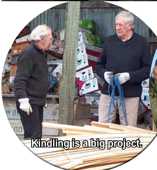
Kindling is a big project.