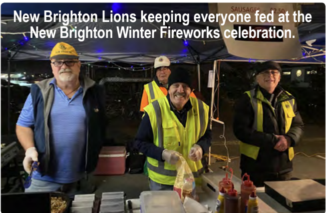
New Brighton Lions keeping everyone fed at the New Brighton Winter Fireworks celebration.

Everywhere we serve, every time we give, we bring kindness and compassion, change and hope. And we make our mark on the lives we touch, the communities we serve and the world we share.