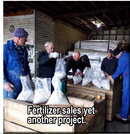
Fertilizer sales yet another project.