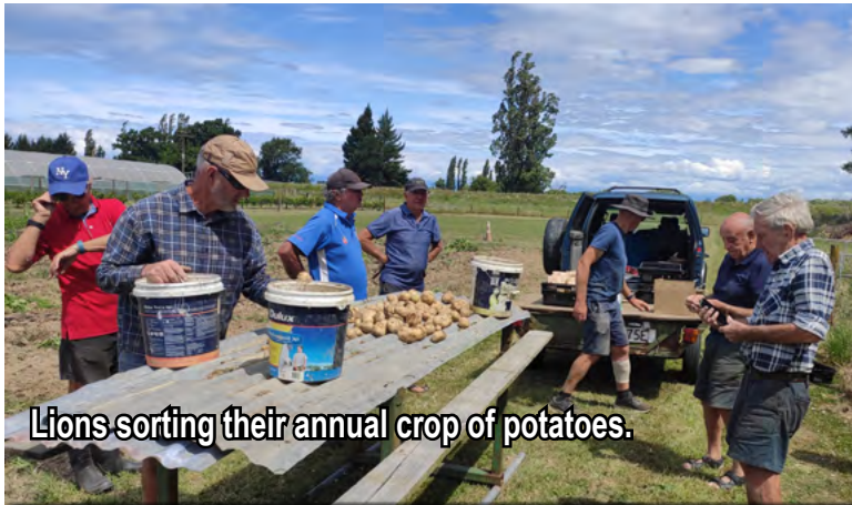
Lions sorting their annual crop of potatoes.