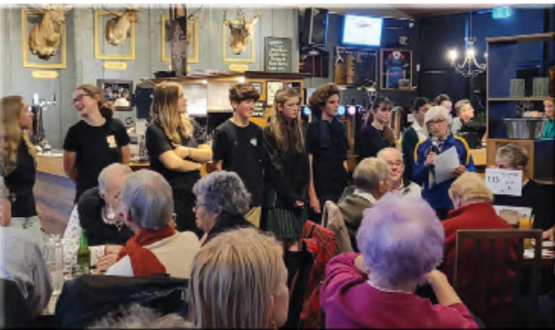
Quiz night - Leos and Guests. (well done Leos and what a great fundraiser for the recipients - we are proud of you all.)