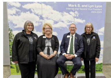
Look who these Lions from NP Central ran into at the 'Meet & Greet' in Melbourne