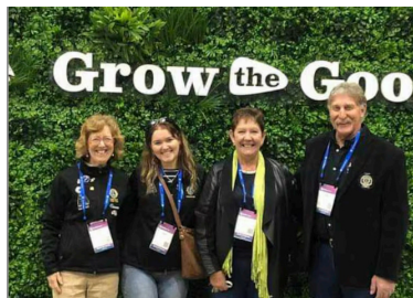
Inglewood Lions looking good at International Convention in Melbourne