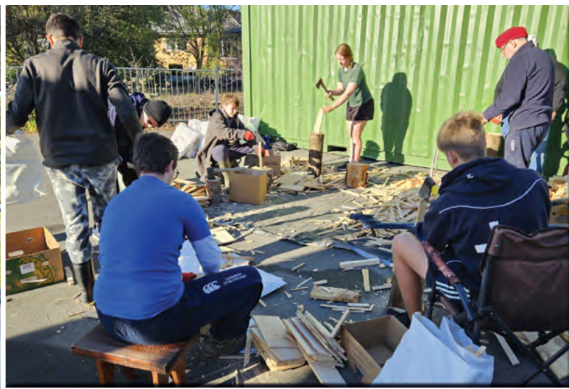
Marlborough Boys' College and Girls' College Leos. A great morning cutting and bagging kindling for Alzheimer's Marlborough. They will be back next week for more mahi and the wonderful morning tea provided.