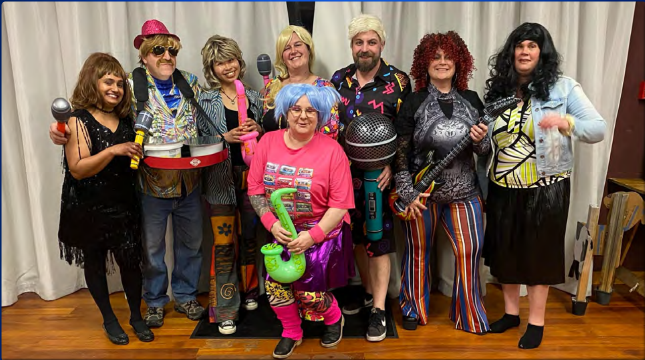
Kaikoura Seaward Lions - Lip Sync - even New World Kaikoura was there - What a night!