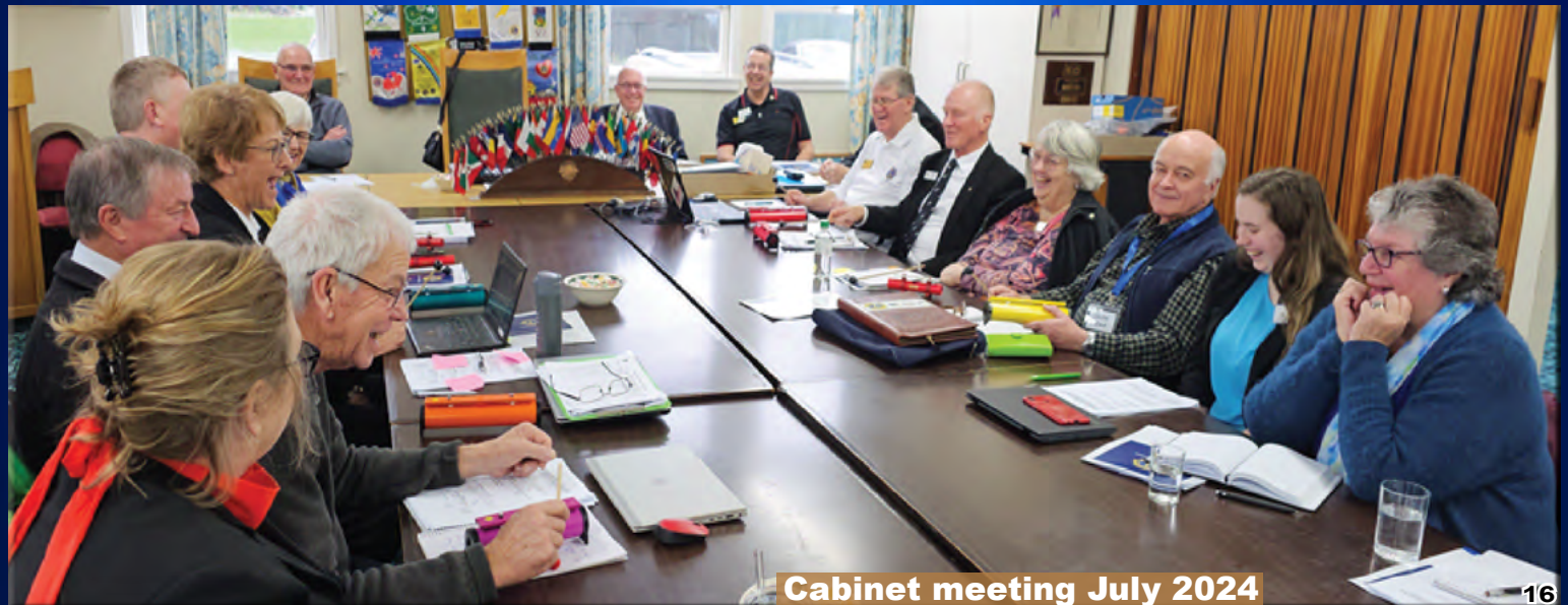
Cabinet meeting July 2024