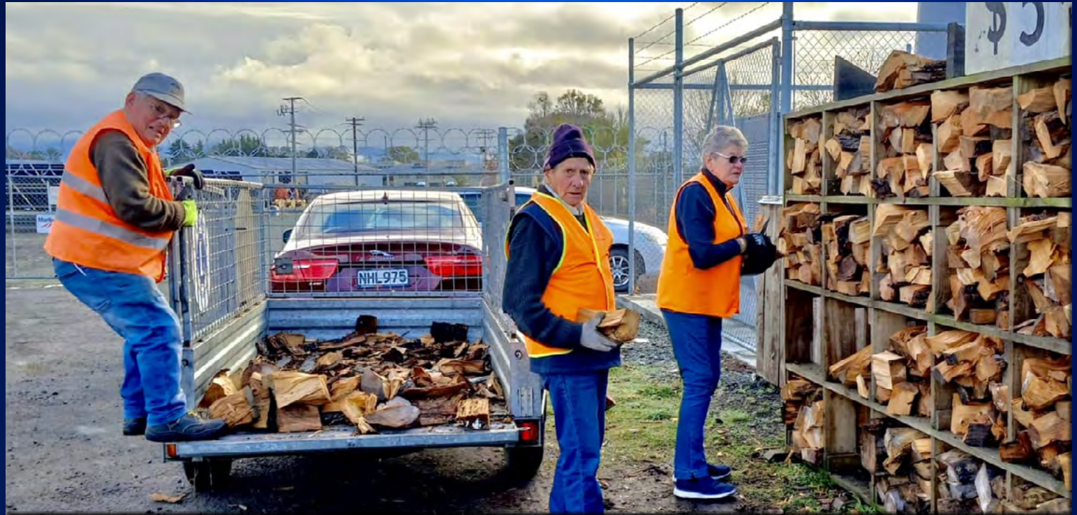
Blenheim Lions Our wood supplies are coming to an end and the dispenser was filled for the last time on 3rd August. Clearly there is a need for small lot firewood in the community but sadly not all feel the need to pay for what they take. A big shoutout to all those who appreciated what we are about. (We all appreciate Blenheim Lions charge of $5 per slot - affordable for all!)