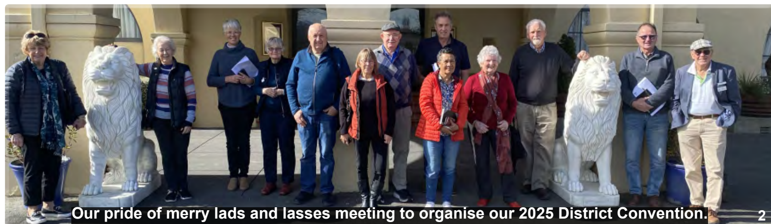
Our pride of merry lads and lasses meeting to organise our 2025 District Convention.