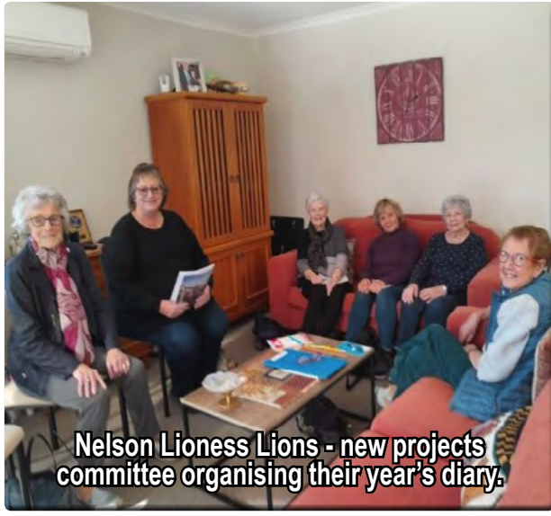
Nelson Lioness Lions - new projects committee organising their year's diary.

Club Supplies You can order New Member Packs and New Zealand Brochures for membership drives through us at the Multiple District Office? T: 0800 546 672 / 09 4274446 E: orders@lionsclubs.org.nz