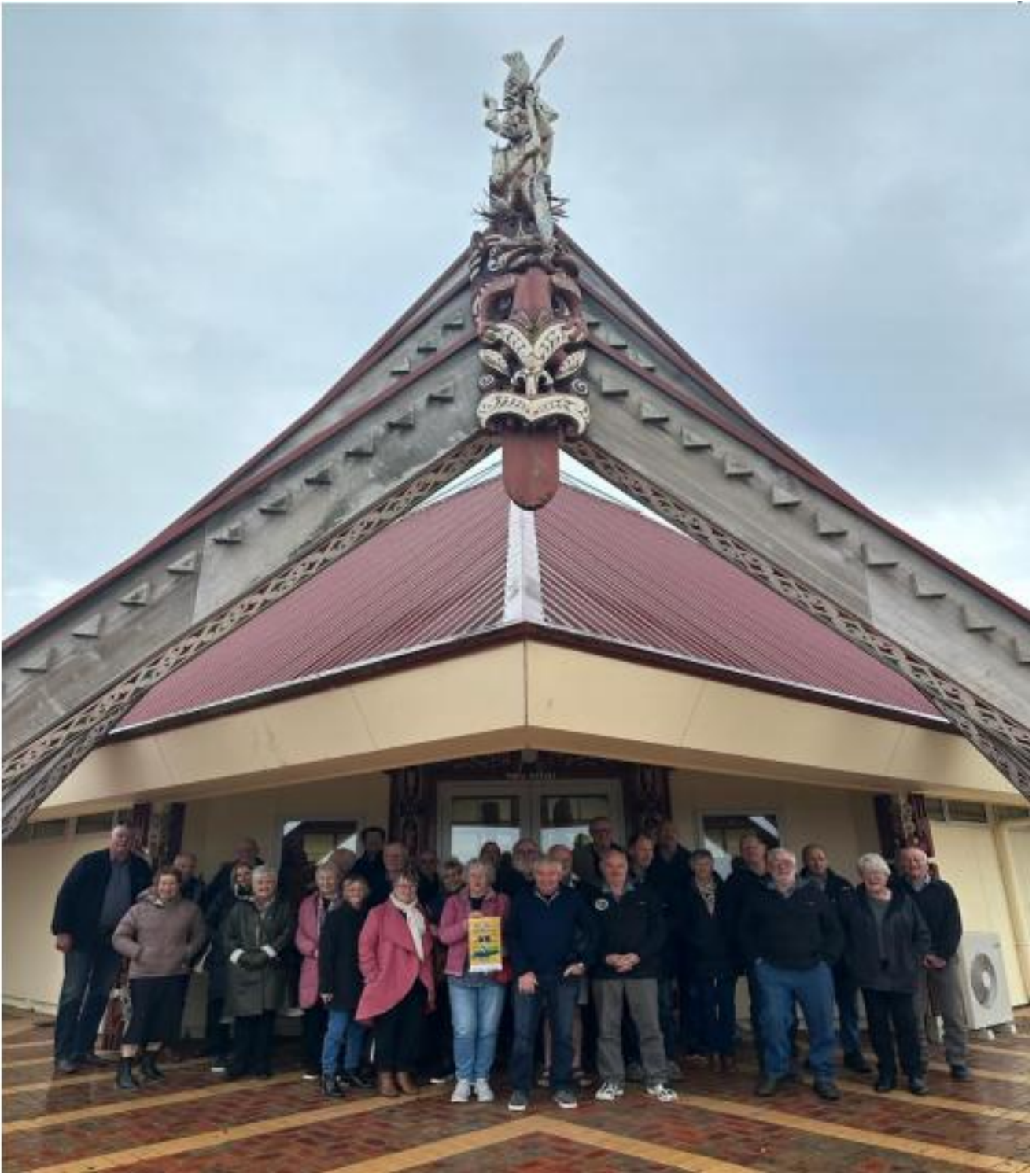
Bluff Marae Visit