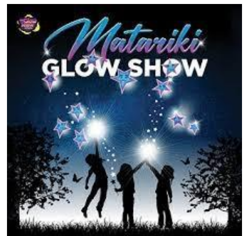
Photos from Matariki in Winton on the 20th of July