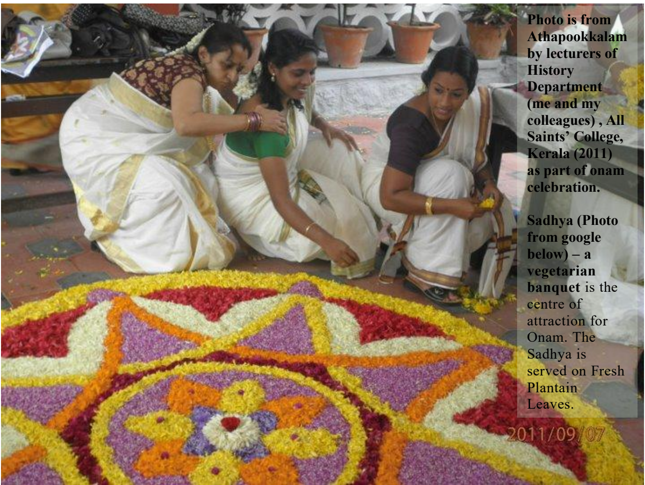
Photo is from Athapookkalam by lecturers of History Department (me and my colleagues), All Saints' College, Kerala (2011) as part of onam celebration.

Finally, the kolam is a beautiful work of art. It is a testament to the creativity and skill of the people who create it, and it adds to the festive atmosphere of Onam.