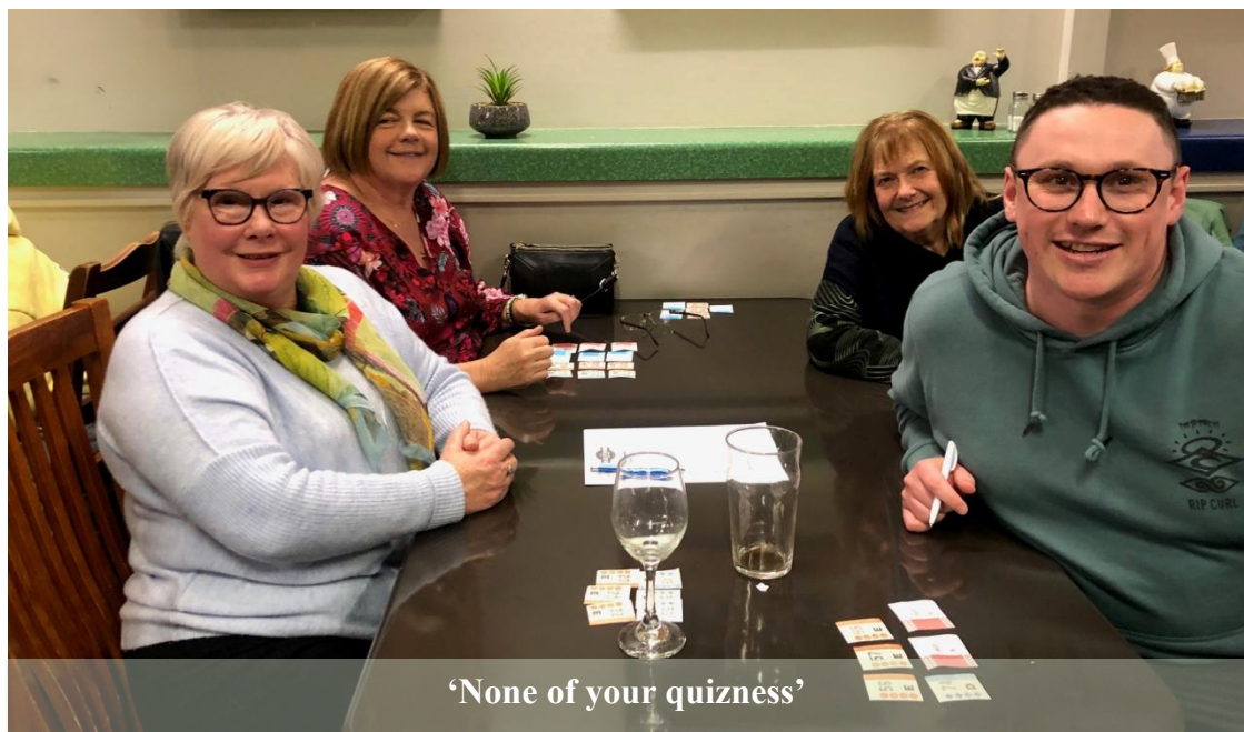
'None of your quizness'