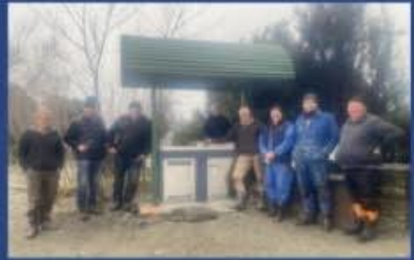
Pictured: The guys on site, getting their hands dirty with the much improved facilities.

Improving Ruby Island public facilities. A roof for the BBQ and two new picnic tables. Thanks to the Ruby Island Management Committee and Lake Wanaka Cruises.