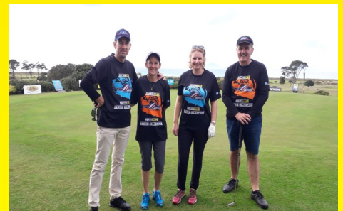
The team from NEST (Northland)