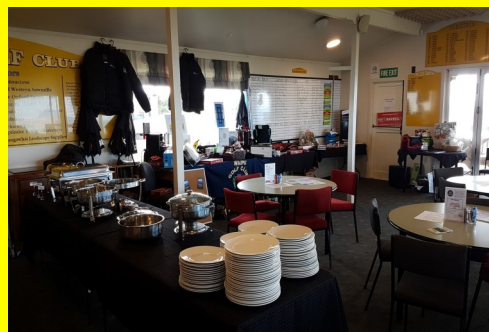
View club rooms and prize table.