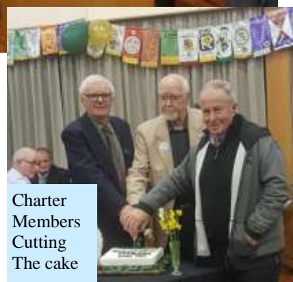
Charter Members Cutting The cake

Congratulations Toi Tois It was a great Night.