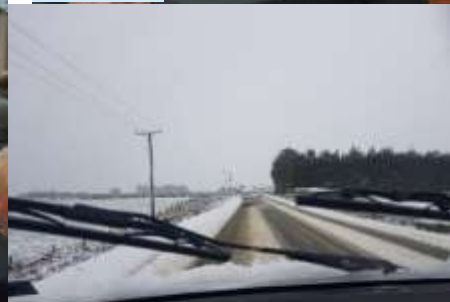
The next day, 6 hour trip home