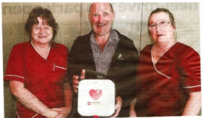
Defibrillator a welcome donation for home

Lions are becoming well known for the donation of defibrillators to needy organisations (with the recent project of Balmacewen Lions donating defibrillators to several local schools and now Ashburton Pakeke giving one to Tuarangi Home).