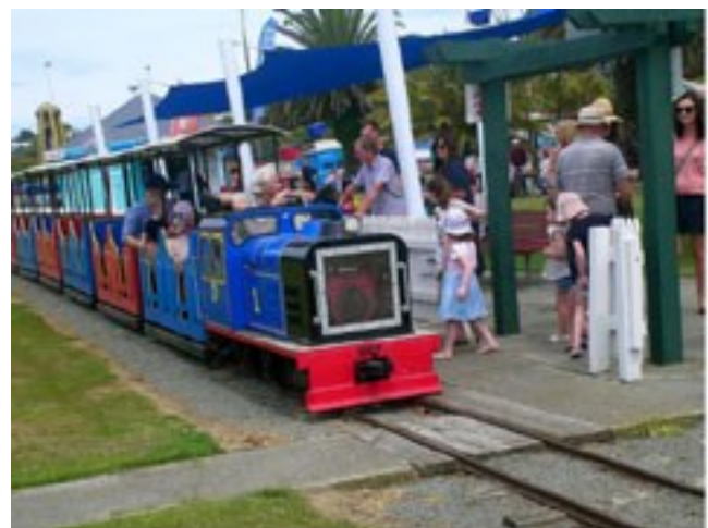
CAROLINE BAY WHEEL TAPPERS AND RAIL CHECKERS PENGUIN EXCURSION SPECIAL