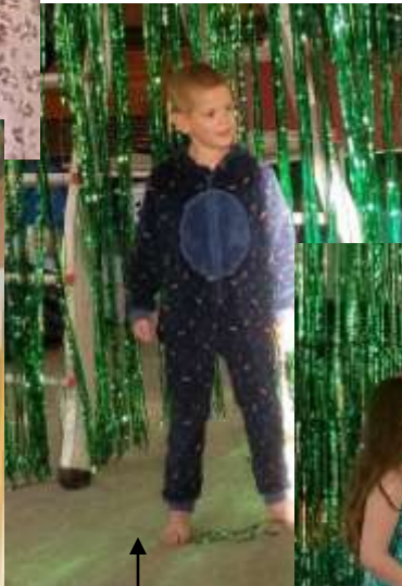
This young man Had heaps of Personality !!!