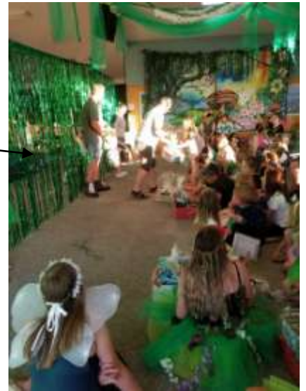
Present time For the children