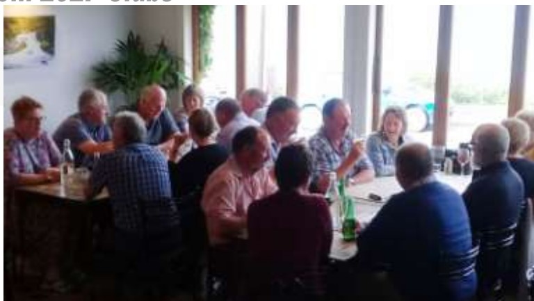
Christmas meal at Beach House Riverton