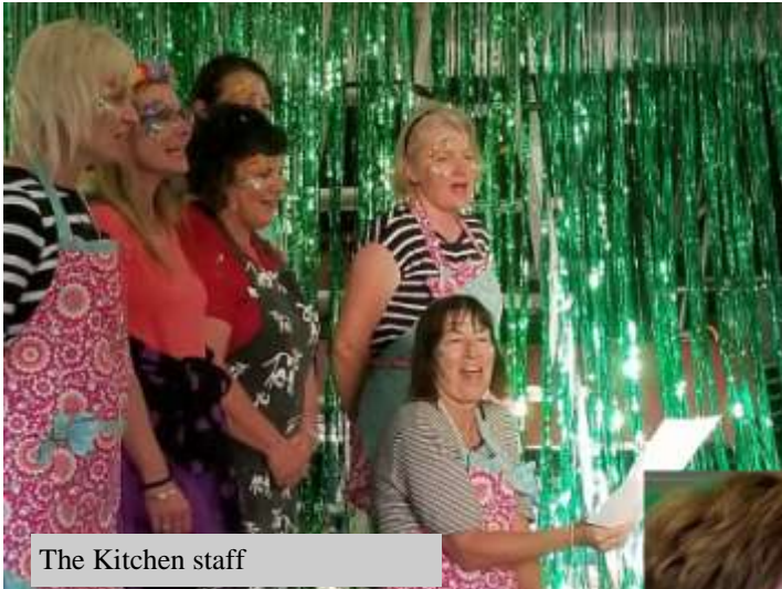
The Kitchen staff